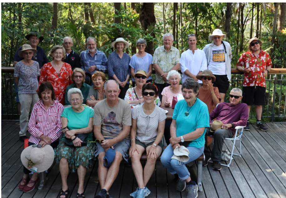
Group Photo time seeing out 2023 at JB Reserve

If you have an unusual plant or seedling that needs a good home, please bring it to a working bee or drop in and see Polly Simmonds at the reserve.