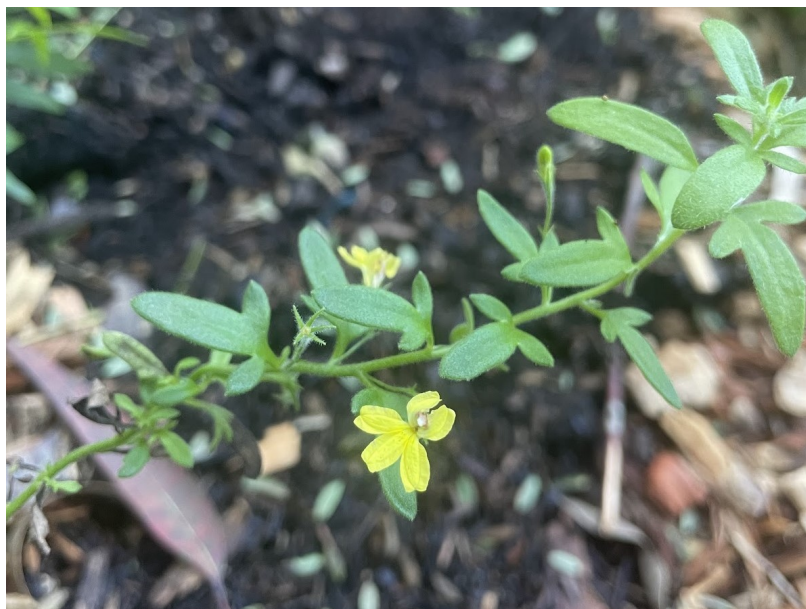
Goodenia heterophylla

Look out for.. G. heterophylla (Variable leaf goodenia)