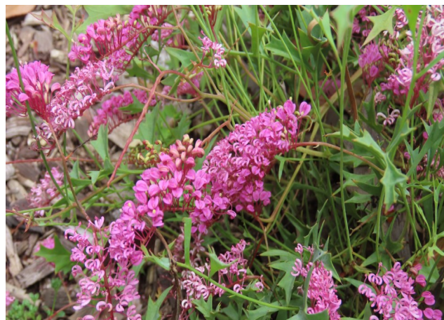
G. leptobotrys