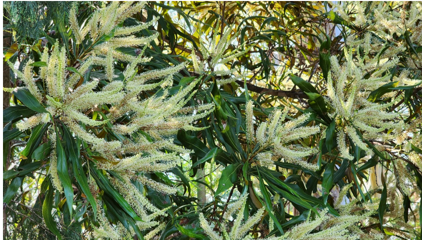
Grevillea baileyana flowers

Grevillea baileyana is a medium to large tree, usually to about 10 metres but occasionally to 30 metres high. Bark is grey, hard and sometimes scaly. Leaves are rich green with the underside of the new growth having a rusty or bronze sheen. This is a particularly useful diagnostic point in the growing period. Juvenile leaves have 5-9 broad lobes but adult leaves are simple, glabrous above and finely silky beneath.