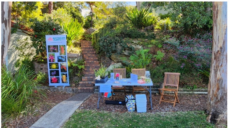
Clare McColl garden, Jannali