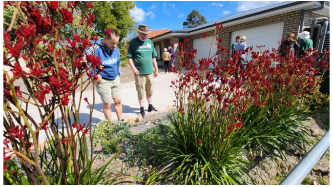
Ralph Cartwright garden, Engadine