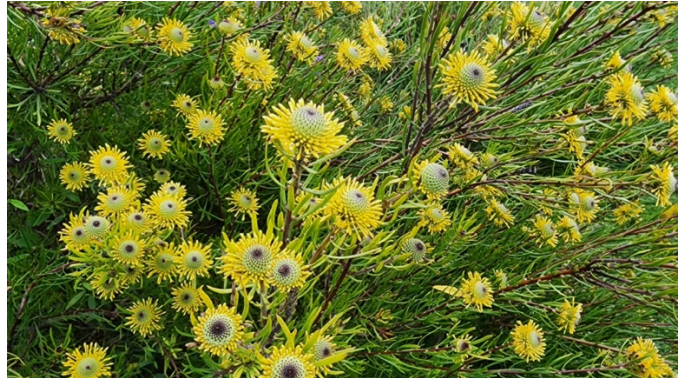
Karen Thorn garden, Engadine (photos from Sept 2022)