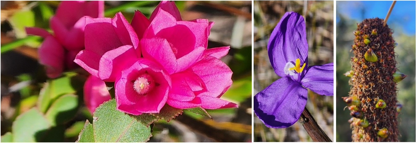
Boronia serrulata , Patersonia , Grass tree (photos Bruce Simpson)