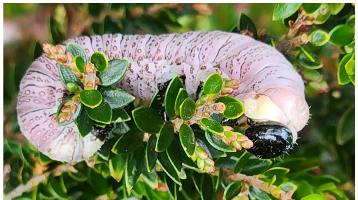
Caterpillar at work