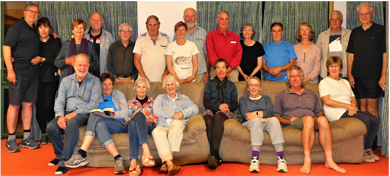
Group photo inside Pygmy Possum lodge