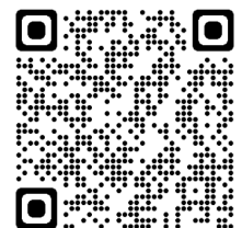
Event page QR