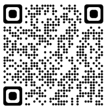
Event page QR

Visitors from further afield can make a day out in Sutherland Shire and also visit Joseph Banks Native Plants Reserve at Manooka Place, Kareela and Sydney Wildflower Nursery at Heathcote. Both are open 7 days, 9 am to 5 pm.