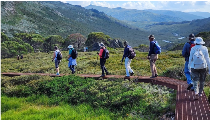
Walk to Guthega