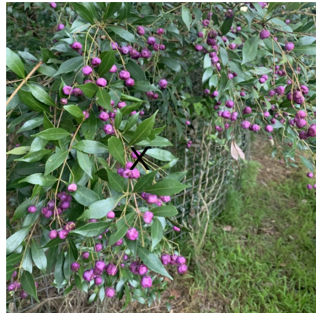
Acmena smithii , Swallow Rock Reserve

There are various species of Syzygium/Acmena (lilli pillis) that have edible fruit, and are prunable for a compact shape or hedge. This one had purple fruit.