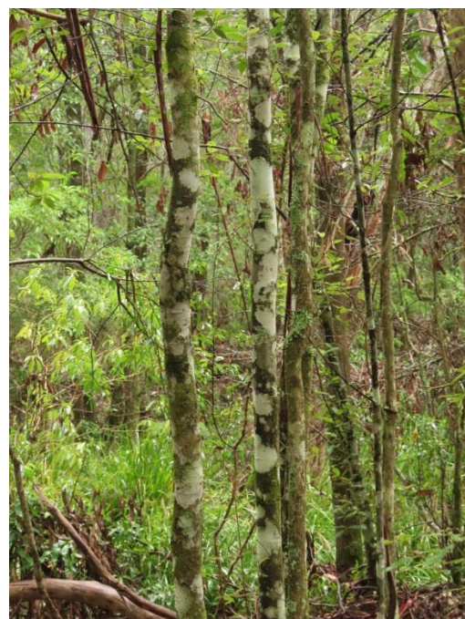
Distinctive bark of Ceratopetalum apetalum - Coachwood