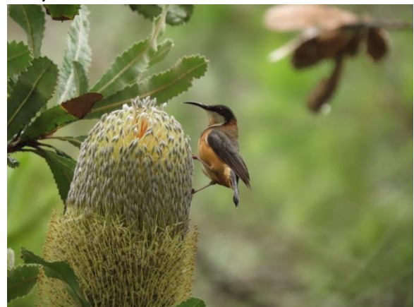
Banksia serrata visited by a male Eastern Spinebill