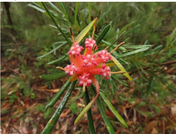
Lambertia Formosa – Mountain Devil