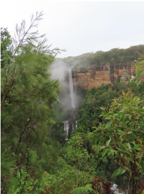
Fitzroy Falls from Main Lookout