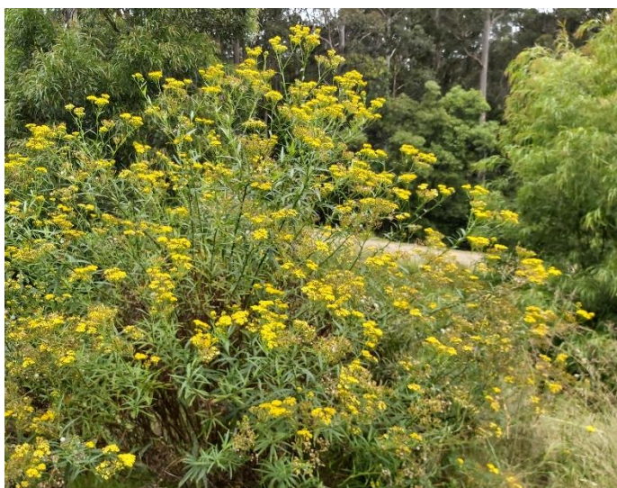
Senecio linearifolia is often thought of as a weedy species, but with regular pruning and watering, is a long-flowering herbaceous perennial.

Some of the unusual plants grown include Austromyrtus tenuifolia , a small woody shrub about 1m high from the Sydney area, which has small succulent purplish fruits. (I note that currawongs are currently enjoying a bountiful fruiting, doing their best to keep the bowerbirds at bay.) Some other plants which few members grow include Persoonia isophylla , another Sydney plant. In the Lamiaceae Family Teucrium corymbosum , known as Forest Germander, a grey foliated shrub with well displayed white flowers, also grows to 1m, and is well suited to mixed border planting. Few grow Lobelia purpurascens (syn Pratia purpurascens ) which has the common name White Root. In garden beds with loose soil it becomes a real weed, almost indestructible, but as we saw here, in a dry garden, it makes an attractive ground cover.