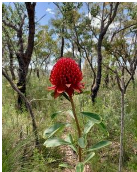
Waratahs are a cherished member of Australia's native flora. Stephanie Chen

The waratah is the official floral emblem of New South Wales, and its spectacular red blooms have been adopted as the logos of state government agencies and sporting teams.