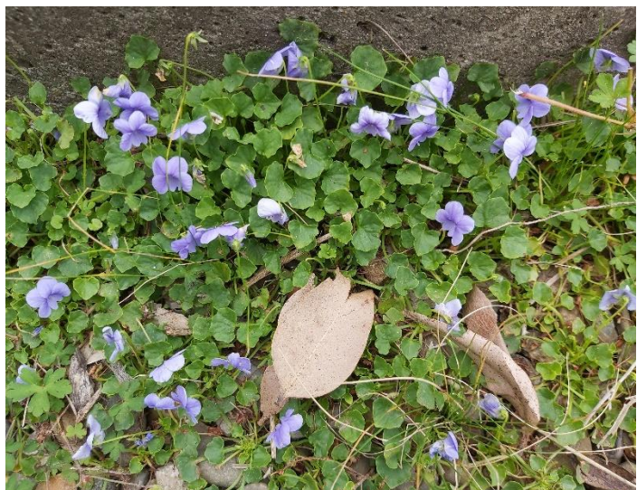
Viola hederacea , Monga Magic, a selected form from the Mongarlowe River area, where it grows with Telopea mongaensis