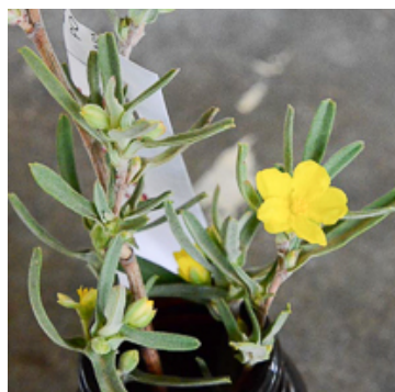
Hibbertia racemosa (Stalked Guinea Flower) widespread in coastal areas of southern Western Australia