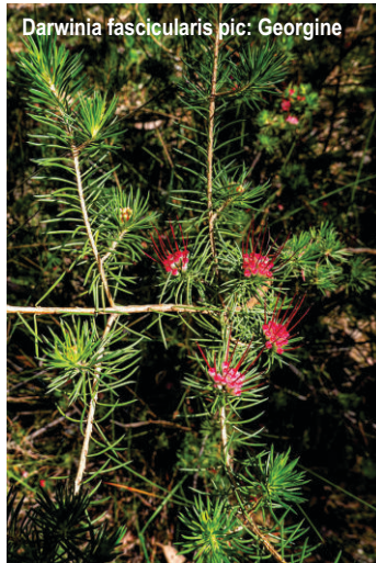
Darwinia fascicularis

The bush to the north of the house had been burnt about six weeks