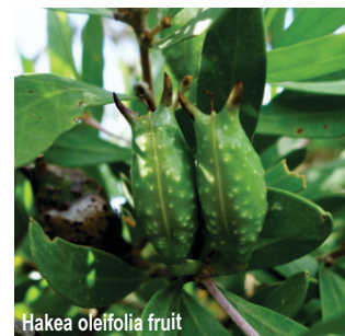
Hakea oleifolia fruit