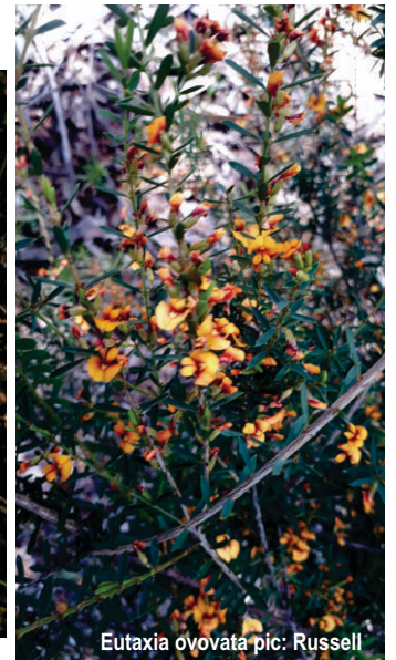
Eutaxia ovovata

previously but there were still plenty of plants close to the house. These included Darwinia fascicularis and Dianella caerulea , Grevillea sericia , and a few of the lovely blue "flags" of Pattersonia sericia . There was more to be seen at the front of the house including two impressive yellow pea flowers - Oxylobium robustum and Eutaxia ovovata . A fine specimen of Dwarf Apple ( Angophora hispida ) - looking anything but dwarf - was in bud. Grevillea speciosa was in flower as was some Kunzea capitata - definitely one of my favourites.