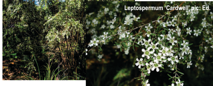
Leptospermum 'Cardwell'