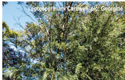
Leptospermum 'Cardwell' , pic: Georgine

with the amount of new planting, all well mulched. Further down, there were a few small Prostanthera ovalifolia in flower and then a very large and spectacular example of the species. Leptospermum 'Cardwell' was in full flower and a substantial oak-leaved shrub with interesting flowers attracted a lot of attention. We were unable to identify it (other than to