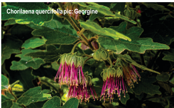
Chorilaena quercifolia