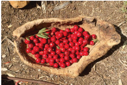
A haul of quandongs harvested in Menindee in a wooden bowl made by Ngiyampaa elder, Beryl Carmichael.

Stewed, dried or raw the quandong is one of Australia's most versatile bush foods — so versatile in fact that it can also be used to aid with foot massages or cure toothache.