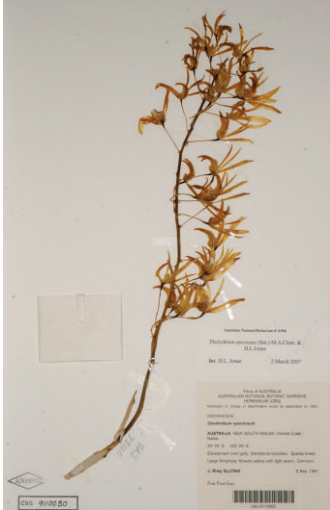
Rock_orchid_specimen - Rock Orchid specimen collected from the NSW Central Coast in 1991, held at the Australian National Herbarium in Canberra.

This research was made possible by rock orchid specimens that were collected over the past 30 years across the species' entire range of more than 2,500 km along the east coast of Australia. The distribution modelling relied on more than 300 herbarium specimens, many of which are held at the Australian National Herbarium in Canberra.