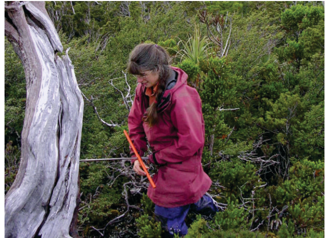
Collecting a core sample from a King Billy pine.

The researchers compared their King Billy Pine chronology to a 3600-year tree-ring chronology of fire-sensitive Huon Pine trees from nearby Mount Read. Based on the composition of the Mount Read chronology, it is apparent that many trees were established after 1150 AD, suggesting good conditions for establishment at that time, such as an absence of fire. In contrast, the much more consistent establishment pattern at Cradle Mountain is consistent with an absence of intense fires for the entire 1700 year record.