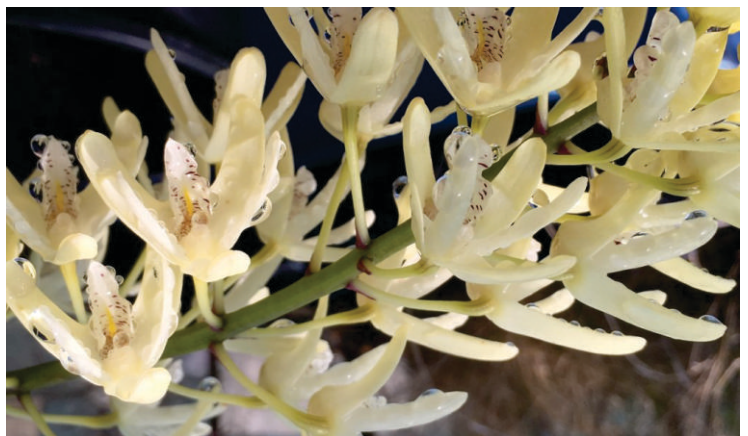
The spectacular flowers of Australia's rock orchid.

Blog.csiro.au October 13, 2017 Andrea Wild