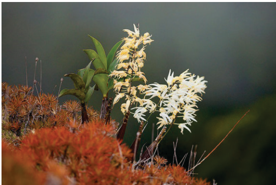
rock_orchid_FNQ - The northern subspecies of Australia's rock orchid growing in its natural habitat in Far North Queensland.