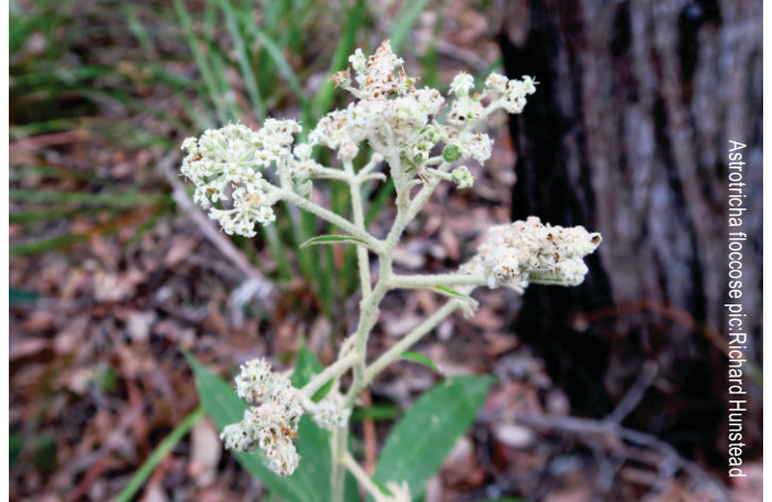
Astrotricha floccosa

From the Red Hands Cave to West Head, the walk was through forest of the following species; Allocasuarina torulosa , Angophora costata , Corymbia gummifera , Elaeocarpus reticulatus and Syncarpia glomulifera . A moderately steep series of well-made steps took us through plant communities which showed the effects of Sydney's Sept-Oct six weeks of drought. Wilted and dying shrubs, smaller than usual flowers and heavy leaf fall from suffering trees. The dominant species