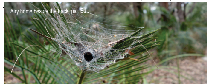
Airy home beside the track.

After the walk, we had lunch at Flower Power, on the Mona Vale Road and some talk reflected on the state of the bush, in the present dry conditions.