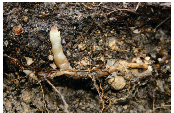
Underground_Orchid - The Underground Orchid spends its life below ground.

The orchid family is the world's largest group of flowering plants. Australia has more than 1,300 species that we know about so far and most of them occur only within Australia. Like the rock orchid, some have an iconic form recognisable by anyone who could spot a potted orchid at the supermarket.