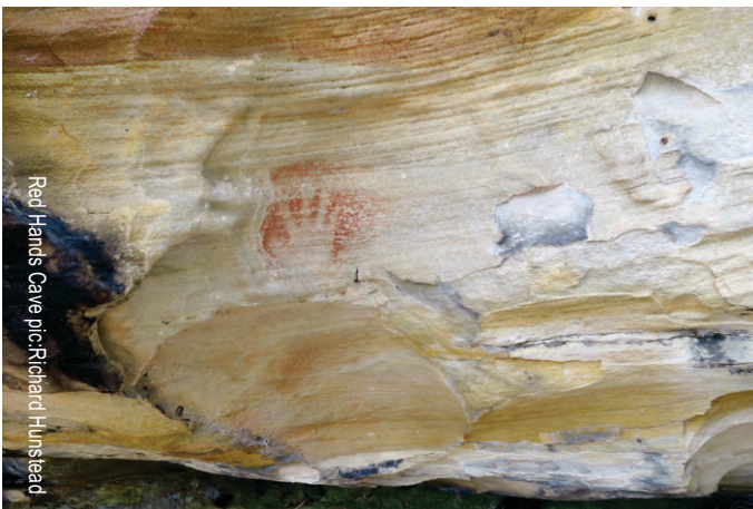
Red Hands Cave

The walk from Garigal Picnic Area to West Head is one of the shortest of the West Head walking tracks. Seven of us assembled for the walk, in the Garigal Picnic area, a popular place for barbecue lunches, under tall Syncarpia glomulifera and Angophora costata . Picnics there can be hazardous, on hot summer days, when lace monitors are likely to sneak up on your food.