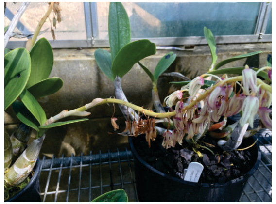
rock_orchid_southern - Now finished flowering, the southern subspecies of the rock orchid is recognisable by its shorter, fatter peduncle (the stem from which the flowers bloom).