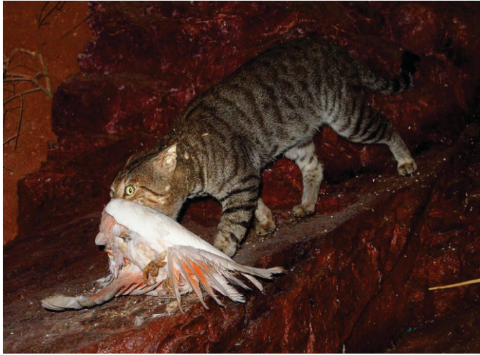
Galahs are among the many native species being killed by feral cats.