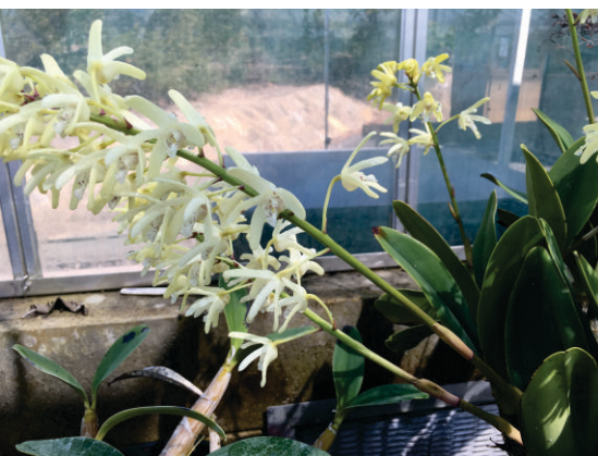
rock_orchid_northern - Photographed at the Australian National Herbarium, the northern subspecies of the rock orchid has a longer, thinner peduncle (the stem from which the flowers bloom).