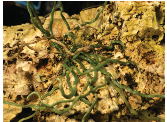
Taeniophyllum_malianum - If you look closely you might spot a tiny flower to the left of on this easily overlooked orchid, Taeniophyllum malianum.