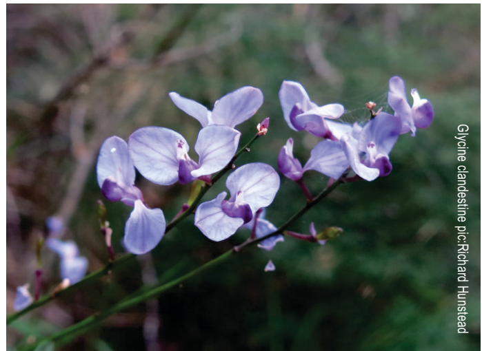
Glycine clandestine

included Gahnia sp, Lepidosperma laterale , Leptospermum squarrosus , Xanthorrhoea arborea , Macrozamia communis and Astrotricha floccosa . There were very few species in flower and those that were included Glycine clandestine , Hemigenia purpurea , Pimelea latifolia and Xanthosia tridentata .