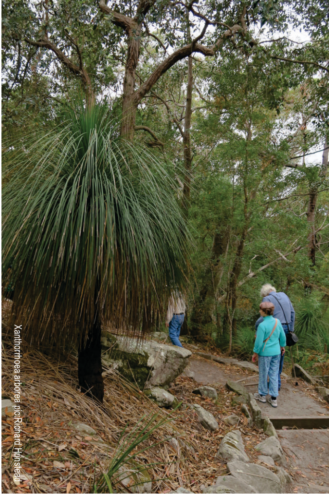
Xanthorrhoea arborea

A planned walk from the Resolute Picnic Area to West Head was put off in March, due to rain. However, despite predictions of rain, again, we had lovely weather conditions for our walk, this time, mild and cloudy.