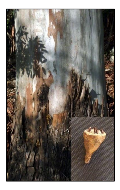
Eucalyptus saligna (Sydney Blue Gum)