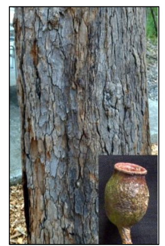
Corymbia gummifera (Red Bloodwood) Bark - crumbly