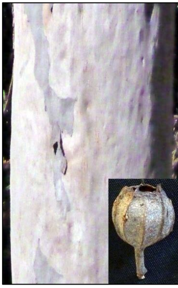
Angophora costata (Sydney Red Gum)

Excellent pictures can be found on the Hornsby Library website found by googling "Hornsby herbarium". Detailed botanical descriptions are given on the PlantNET website: plantnet.rbgsyd.nsw.gov.au