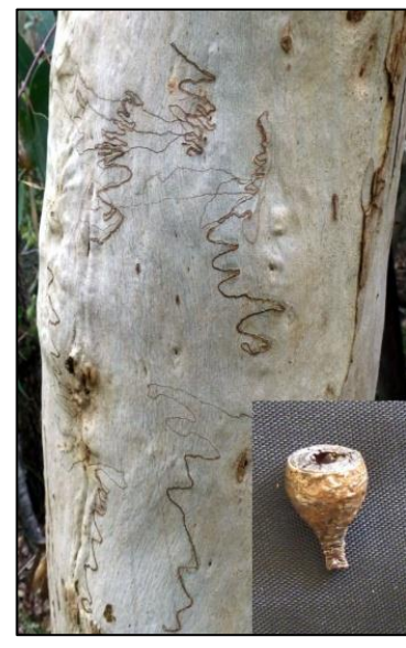
Eucalyptus haemastoma (Scribbly Gum)