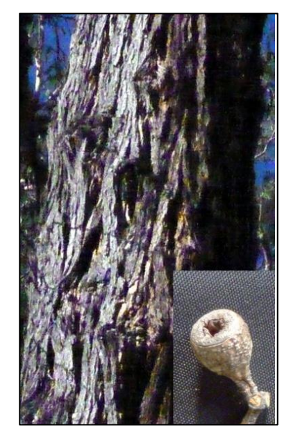
Eucalyptus sieberi (Silver-top Ash)