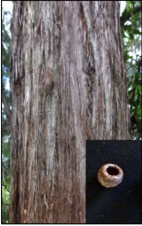
Eucalyptus oblonga (Sandstone Stringybark) Bark - stringy