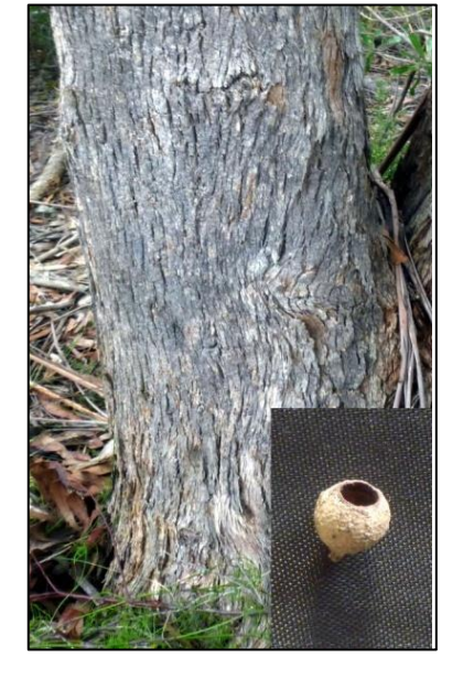
Eucalyptus piperita (Sydney Peppermint)