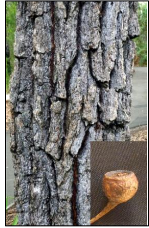
Eucalyptus sideroxylon* (Red Ironbark) Bark - very hard