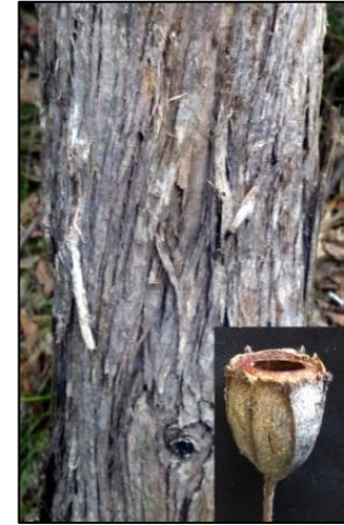
Angophora hispida (Dwarf Apple)