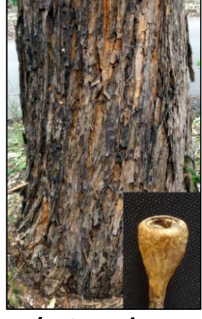
Eucalyptus microcorys* (Tallowwood) Bark - fibrous