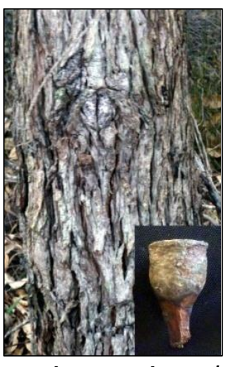
Eucalyptus robusta* (Swamp Mahogany) Bark - crumbly