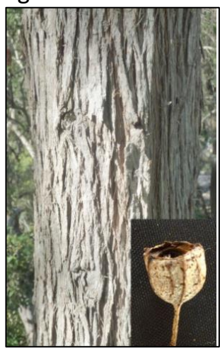
Angophora floribunda (Rough-barked Apple)