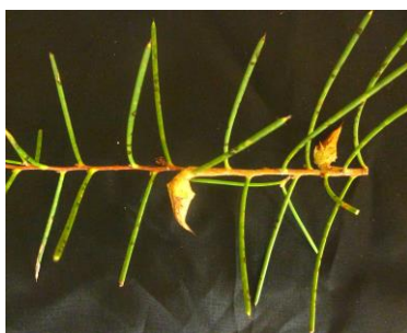
Hakea teretifolia: "Dagger Hakea" – spiky, needle-like leaves beak-shaped fruit