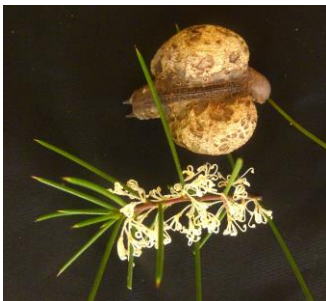
Hakea sericea: "Needlebush" – spiky, leaves; white flowers large, round, horned fruit