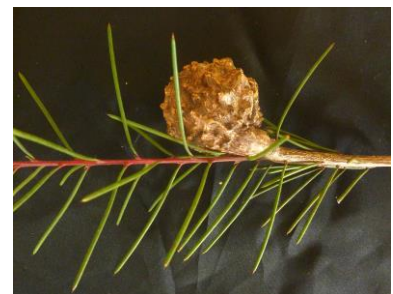
Hakea propinqua: Spiky, needle-like leaves large, round, 'warty' fruit with no beak