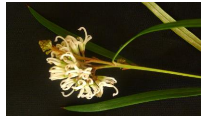
Grevillea linearifolia: Inflorescence of smallish white spider flowers; linear leaves