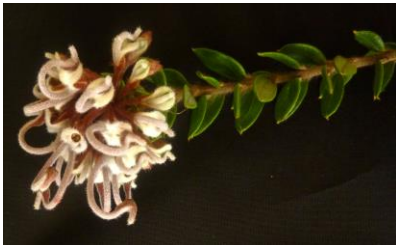
Grevillea buxifolia: Inflorescence (flower cluster) of hairy, grey-brown spider flowers; ovate leaves

Detailed botanical descriptions are given on the PlantNET website: plantnet.rbgsyd.nsw.gov.au