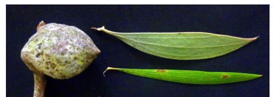
Hakea dactyloides: Both have flat leaves with three central veins and slightly warty fruit. H. laevipes (top leaf) has lignotubers from which regrowth occurs after fire

PLEASE RETURN THIS SHEET (IF LAMINATED) AFTER USE