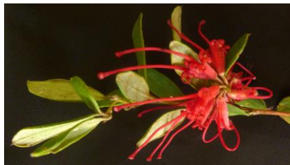
Grevillea speciosa: Inflorescence of bright crimson spider flowers; ovate leaves