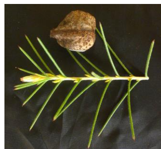
Hakea gibbosa: Spiky, needle-like leaves (new growth is hairy) large, round, horned fruit