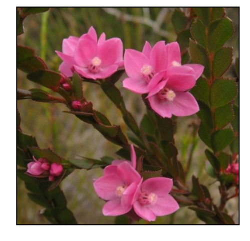
Boronia thujona (odour like pine oil)

Hairless shrub/tree to 4m. Branchlets with 2 grooves separated by decurrent leaf bases.