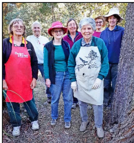
The propagation team who work ALL year to ensure that there is a generous supply of healthy plants for sale.