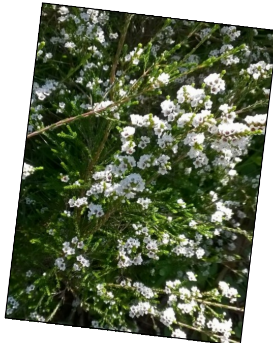
Micromyrtus ciliata