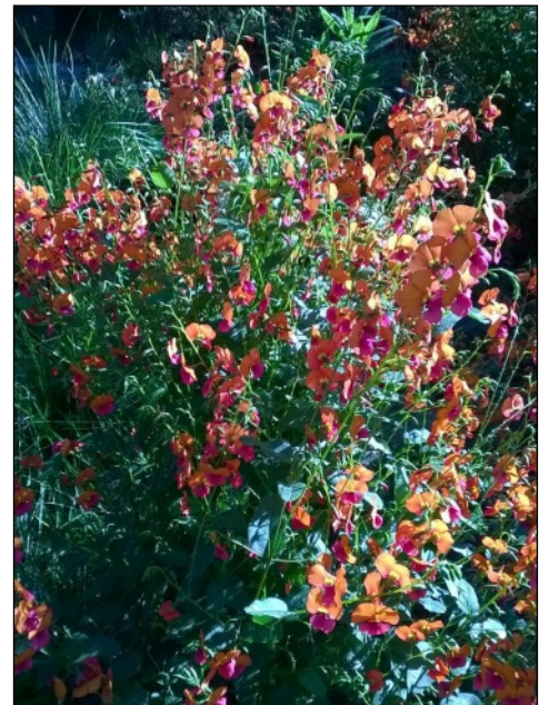
Chorizema cordatum , the Heart-leaf Flame Pea, is a native of south-western Western Australia but does well in Thornleigh.

Another rambling attractive plant from WA, Templetonia retusa , in Jan W's garden.