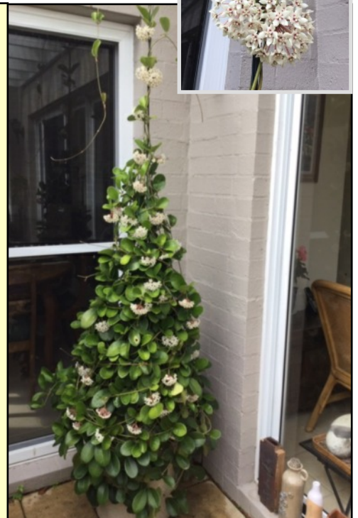
Margaret Hamilton's Hoya australis looking magnificent

Please keep learning about and growing our native plants!