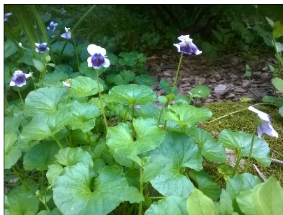
Viola banksii, Native violet

We hope that you enjoy your association with APS NSG and its members. We look forward to getting to know you and share with you knowledge and enjoyment of our wonderful native plants.