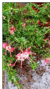
Grevillea "winter delight"