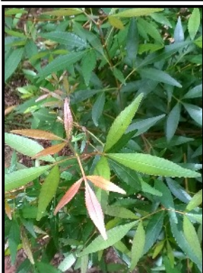
Beautiful new growth on Ceratopetalum gummiferum 'Johanna's Christmas'