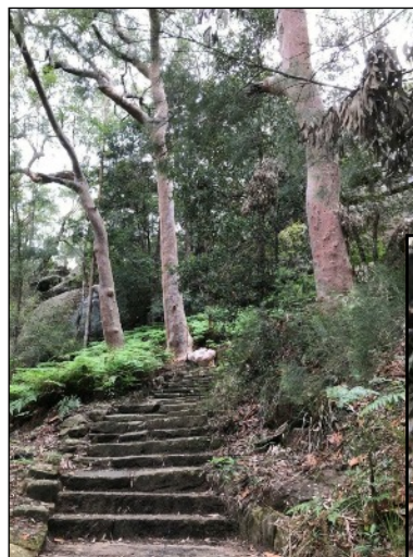
in Berowra Valley National Park in April. Crowea saligna In flower.