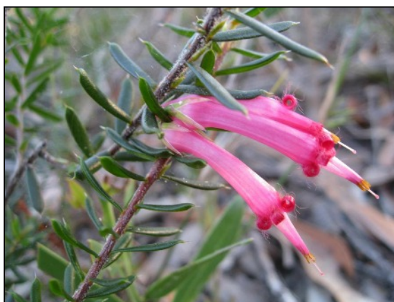
Styphelia tubiflora x