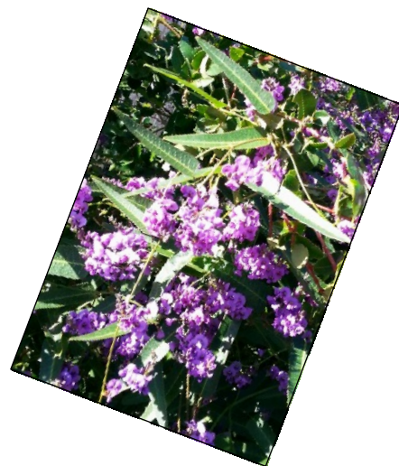
Hardenbergia violacea 'happy wanderer'

These sales may form a major part of our income in 2020 if we don't have a wildflower festival!!!