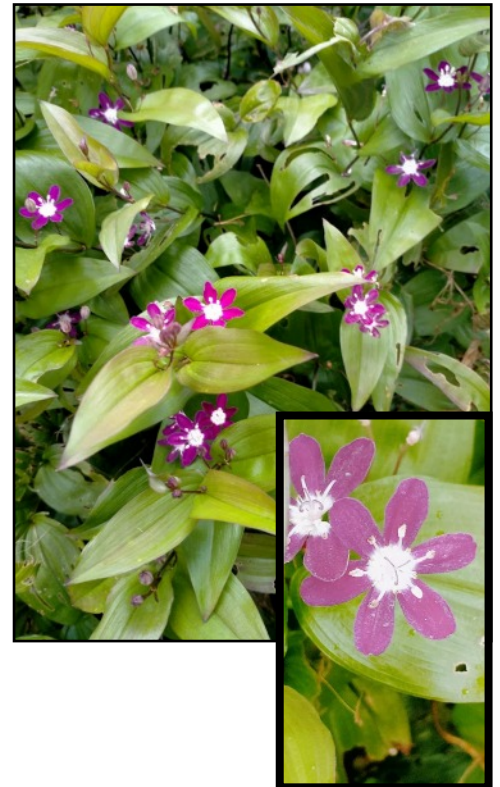
Tripladenia cunninghamii, the uncommon darker form

https://www.csiro.au/plaguesandpredators