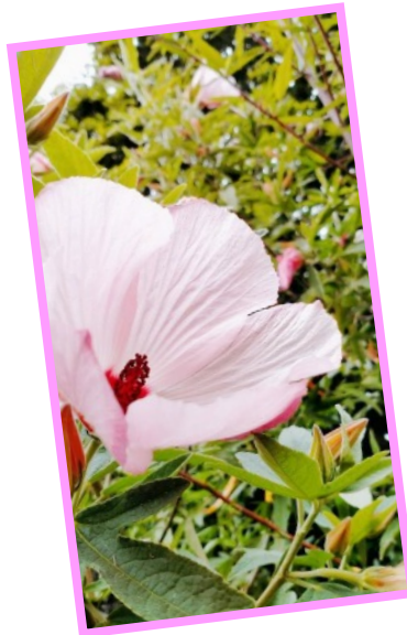
Plenty of pink colour in Jan's garden at present with two native hibiscus species in full bloom.

The Knoll Fridays 14 th & 28 th January 2022 at 10 am to