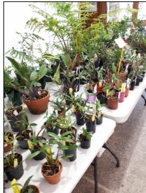
Ready to go on Sunday Sue B