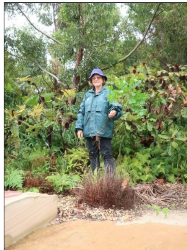
Sue couldn't help herself- weeds beware!

The new APS NSG shirts (100% cotton) There are 6 sizes available. The cost is $25.50 .