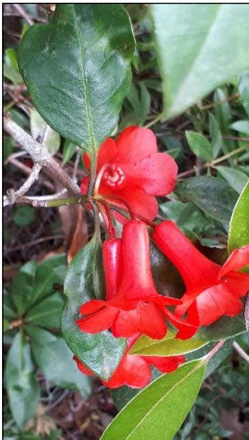
Rhododendron lochiaie flowers in Sue Bowen's garden