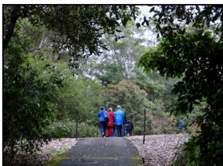
Images from APS NSG visit in 2014