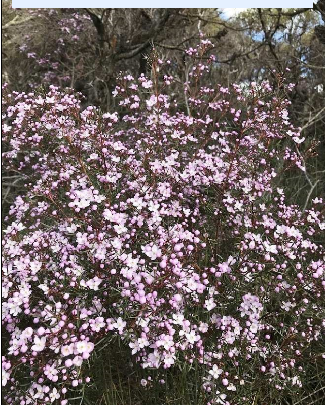
Boronia thujona at the Barren Grounds near Kiama