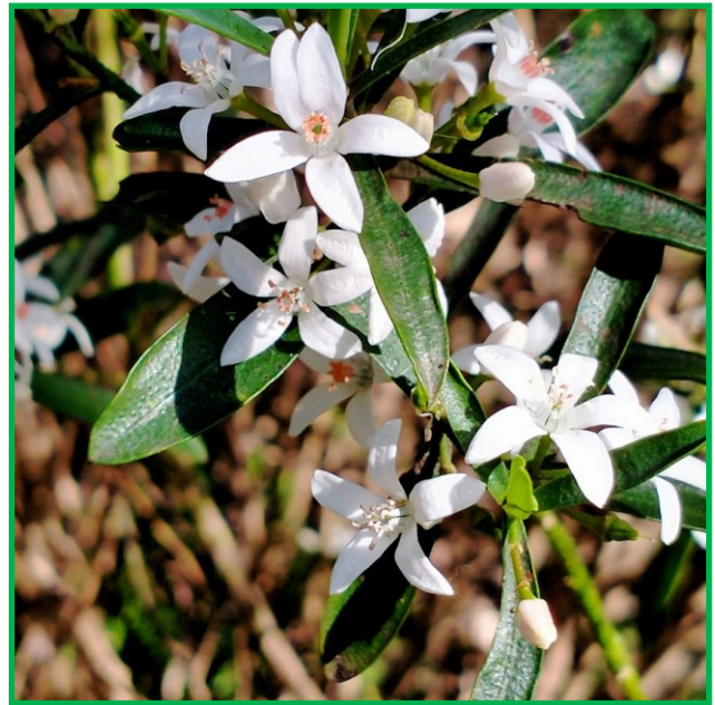
Philotheca myoporoides

Boongala Gardens Friday, Saturday, Sunday and Monday 10am to 4pm From Friday 2 nd September to Monday 10 th October, 2022 76 Pitt Town Rd, Kenthurst Full details: https://www.boongalagardens.com/