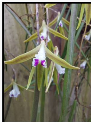
Dendrobium tenuissimum which is now known as Dendrobium mortii apparently. I have had this orchid for 30 plus years and flowers every year.