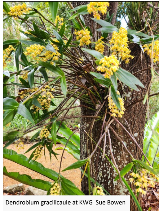
Dendrobium gracilicaule at KWG Sue Bowen

SueBowen captured the brush turkey being super industrious maintaining his mound immediately adjacent to Caley's Pavilion.