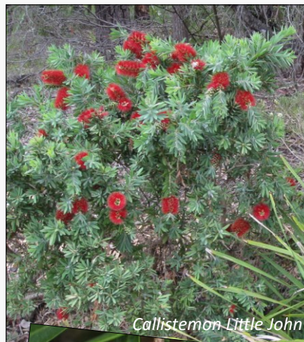
Callistemon Little John