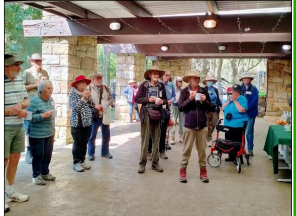
Afternoon visit to KWG. As was in keeping with the catering for the entire conference, an excellent afternoon tea was provided by KWG staff and APS NSG.