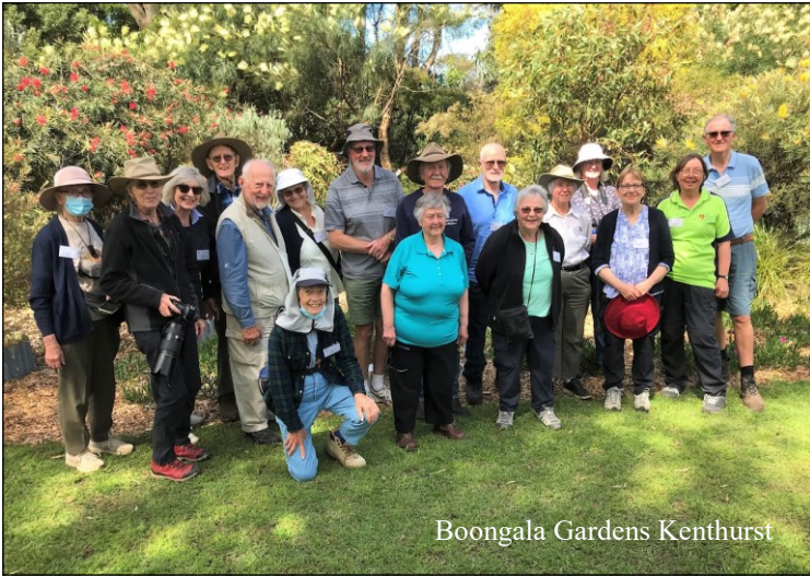
Boongala Gardens Kenthurst