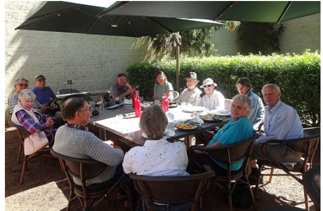
A convivial lunch finished off the visit