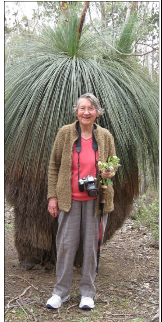
Grass Tree Rest Centre Seymour, Victoria taken in 2009

Jenny was instrumental in the regeneration of Observatory Park, Beecroft which she documented (2001) "Regeneration of remnant Blue Gum High Forest following the cessation of mowing" Cunninghamia 7 (2): 173-182.