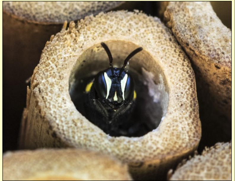
Masked bee, female Hylaeus nubilosus