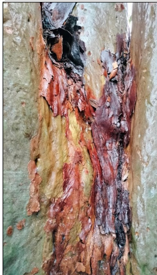
Angophora costata