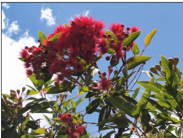
Corymbia ficifolia, WA flowering gum