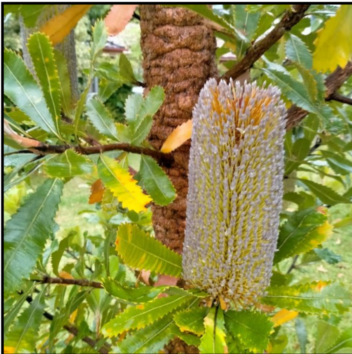
Banksia serrata spotted while dog walking. Jan W.

Photo: Cymbidium suave seedling developing in a tree trunk in the Knoll Garden as a result of manual dispersal of seed in possibly receptive locations. Orchid seed was donated by a member.