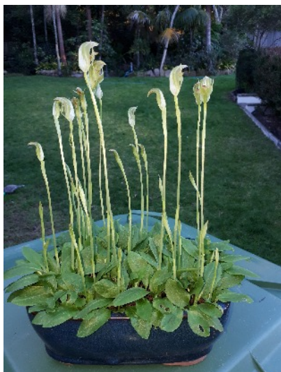
Late July: Pterostylis curta in flower Sue Bowen

Would you like to clone your favourite plants and create your own supply of plants???