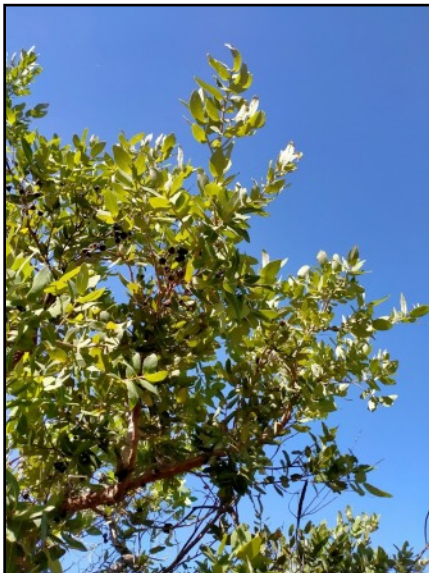
A very healthy Angophora hispida .

We have certainly been able to enjoy the great outdoors in magnificent weather.