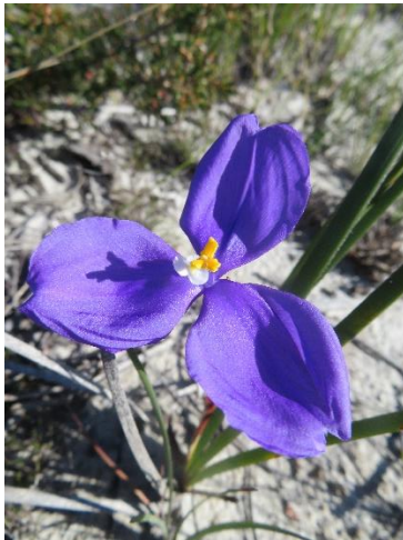
P. sericea , P Forbes.

Here are a few of the native plants from all over the country that, in my experience, have proven to be very suited to Sydney gardens: Pattersonia occidentalis - native Iris from WA. Does extremely well, clumping, wonderful display in October. ( P. sericea is our local one).