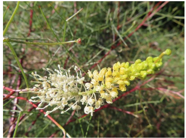
Grevillea vestita , firestation garden P Forbes