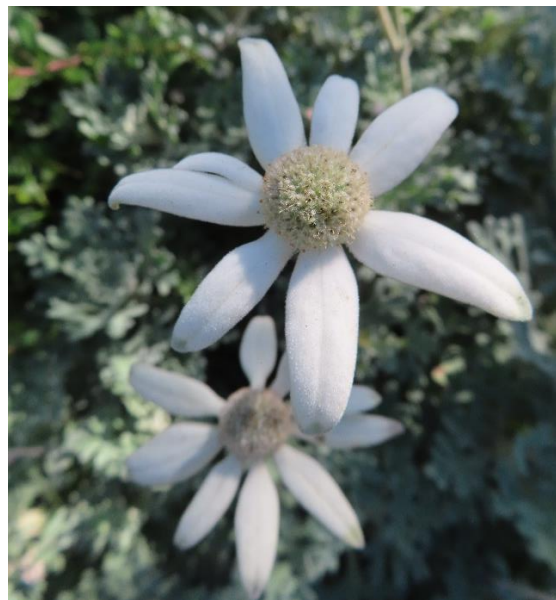
Flannel Flower, fire station, P Forbes.

The flowers that elicit the most comments are the Flannel flowers. a variable beast. In the forests and mountains it tends to be wispy and short lived. Here it is a strapping, robust, perennial shrub a reversal of the observable trend of coastal plants being smaller or even stunted by the sun, salt and wind on the coast when compared to their more inland cousins. Why is it so?