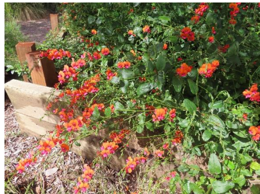
Chorizema cordatum flourishing in fire station garden. Lots available for sale, Tuesday morning! P Forbes.

Libertia paniculata - good border plant, clumping, self seeds without being a nuisance, lovely white flowers, takes shade. Conostylis aculeata - from SW corner of WA flowers through winter and into spring, spreads, easy to propagate, (vulnerable to frost). C aurea from WA is also lovely. Goodenia ovata - wonderful ground cover, great spillover plant, shade. Chrysocephalum apiculatum - 'Yellow buttons' – flowers through spring and early summer, stunning grey foliage, loves hot, dry conditions. Austromyrtus dulcis - 'Midgen Berry' - wonderful fruit, (great on cereal - supposed to be high in Vitamin C), does well in shade to full sun, effective ground cover, easy to grow (but watch out as female bower birds love it!). Grevillea thelemanniana - low-growing, spreading, good colourful ground cover. Chorizema cordatum -'WA Flame Pea'- my favourite, good shade plant, (though snails like it).