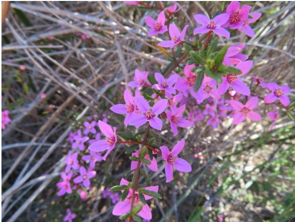
Boronia ledifolia , P Forbes.

We in Sydney are particularly blessed with our temperate climate which is amenable for growing a wide range of plants and so 'The Pick of the Crop for Sydney Gardens' is easier to assess by looking at what native plants are problematic - that is, to think about what plants don't grow well.