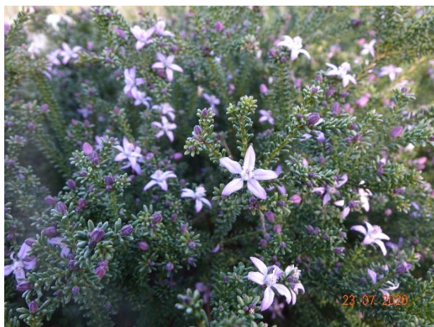
Philotheca salsolifolia , Kurnell, L Hedges.

The regeneration of the melaleuca/banksia heath slowed to almost a stop in the drought that followed the fire, though the attractive prostrate grey-leaved Themeda triandra on the edges of the heath, where sand meets rock, seem to have completed a cycle or two.