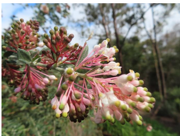
Grevillea vestita flowering for the first time in the firestation garden, P Forbes.