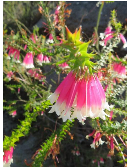
Epacris longiflora , P Forbes.

it into the ground, the tap root is spiralling and doesn't do the job the it is meant to do. The majority of plants that we buy are grown by cuttings. They have no tap root!! The roots formed are called adventitious roots, which means 'not by nature'. They don't do the job that the tap root does in nature. Even plants grown from seed usually don't develop a viable tap root because it spirals from an early stage once potted.