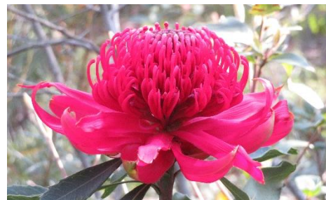
Waratah, P Forbes.