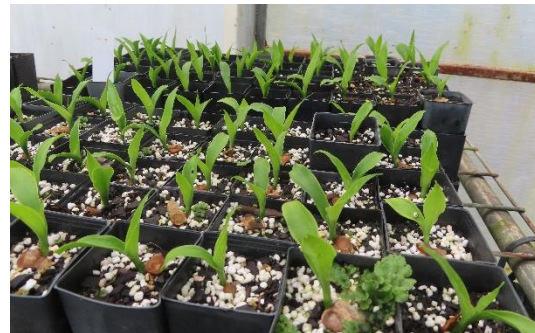
Some happy Gymea Lilies, up and thriving