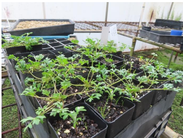
Pink Flannel Flowers, P Forbes.