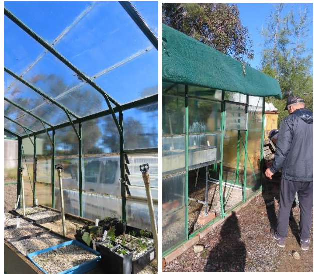
All clean on left but damaged panes removed on right.