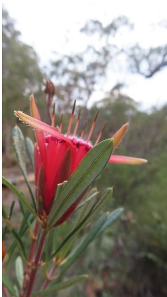
Lambertia on Curra Moors.