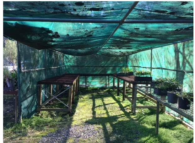
Very shady shade house!

The shade house had grown very dark due to overhanging trees and dirt and lichen build-up on the shade cloth.