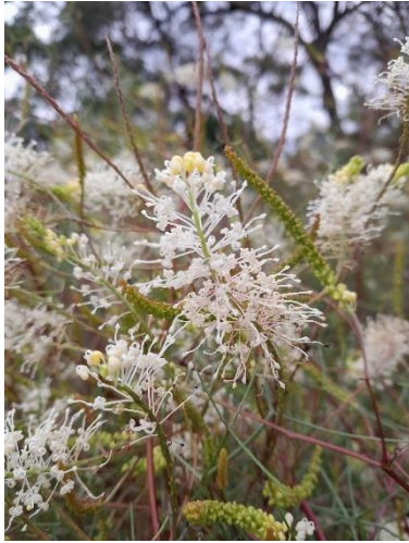
Grevillea intricata at fire station. P Forbes.