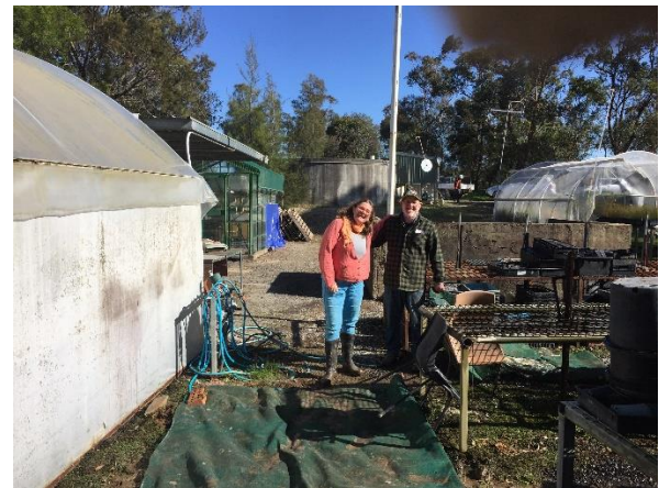
And a new walkway from the old shadecloth.

Lastly, the polyhouse has been (debatably) spruced up by removal of its luxuriant carpet of liverwort. Now we can feel spring in the air, and the much delayed potting mix has finally turned up, we are ramping up propagation. Tube stock production for the Glossies in the Mist and Adopt-a-Tree projects are on-going and seed stores are getting sorted for priority sowing of many more plants for sale and distribution. Coming up soon are more Grevillea Park open days, the SSC Bushcare Fair at Parc Menai, and the APS conference in Kiama, which all have plant sales.