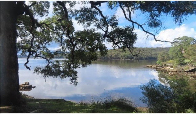
Looking towards Jibbon from Warrumul. P Forbes.

3,4,10,11 Sep Grevillea Park Botanical Gardens open days.