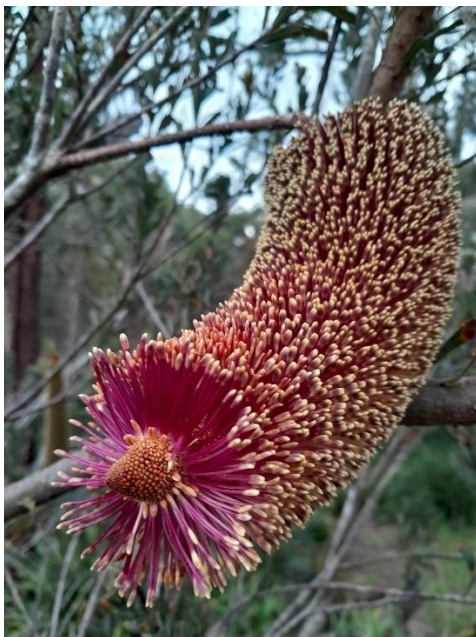
Banksia praemorsa flowering at the fire station, P Forbes.