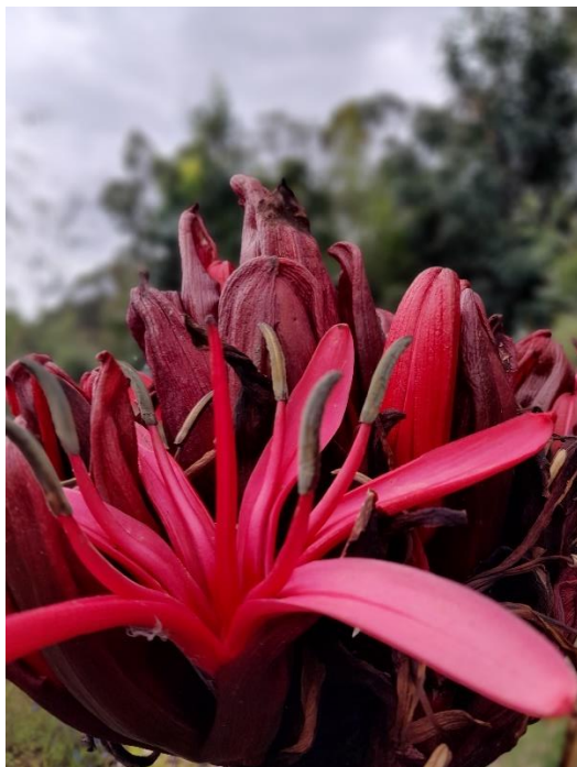
Gymea Lily, fire station garden. P Forbes.

Website www.menaiwildflower.austplants.com.au