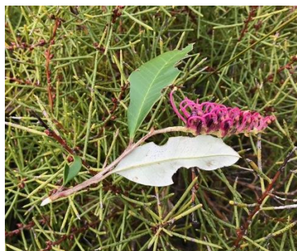
Grevillea milleriana.

All three species are linked morphologically and historically to the Victorian species G. barklyana F.Muell. ex Benth., which remains taxonomically unaltered from recent treatments. For the sake of convenience, all four species ( G. barklyana , G. macleayana , G. gilmourii and G. milleriana ) are grouped informally into an alliance, the Grevillea barklyana alliance, for which diagnostic characters are outlined and two identification keys are given. They are putative members of the Aspleniifolia / Hookeriana Subgroup of the Grevillea pteridifolia Group.