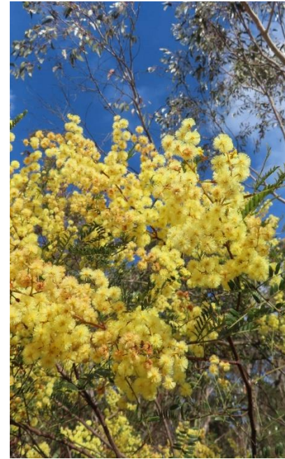
Local wattle flowering well. P Forbes.

https://www.nma.gov.au/explore/blog/wattle-day .