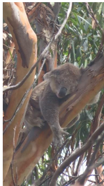
Local koala.