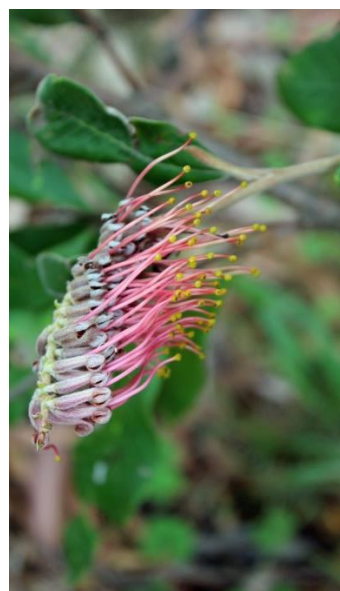
Grevillea macleayana . P Olde.

Conservation recommendations are provided for both new species.