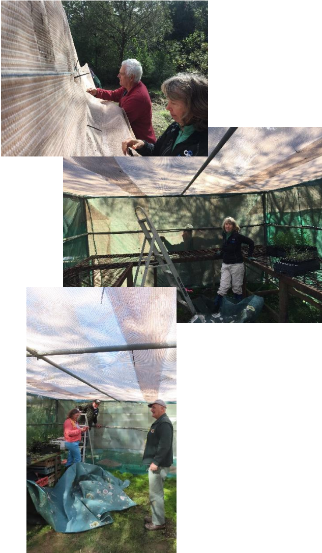
Team at work replacing roof.

Some new shade cloth over the top has made a big difference and its installation provided a challenging but fun team project, especially working in gluggy mud. With an added clean-up inside it is looking much more professional. The old lichen-encrusted shade cloth was adaptively reused as silt-mesh flooring for the waterlogged area between the shade house and polyhouse.