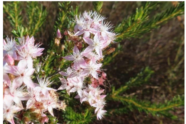
Caliatryx on Curra Moors. P Forbes.