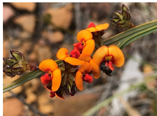
Daviesia alata - Menai GRNP

Daviesia alata is another rarely seen pea flower, although according to local flora experts, it is now presumed extinct north of the River (having not been seen in Georges River NP for over 15 years since last sighted at Picnic Point). It grows as a low groundcover shrub with stems having a triangular cross-section and its leaves reduced to scales. There are very few specimens remaining south of the River at Menai on the laterite areas and these are also under threat due to poor land management such as clearing and the dumping of mulch.