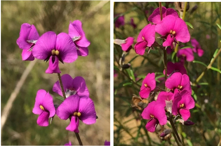
Mirbelia speciosa showing three colour forms (purple, pink and white) as seen at Picnic Point

With just a few local peas described in this article, you can at least appreciate some of the treasures that can be found in our local bushland. In an area that is also diversely-rich in Proteaceae and Myrtaceae , the many members of the sub-family Faboideae make up a significant part of the eco-system. While many of us can enjoy the colours on display as they brighten up the landscape, more importantly, they play an significant role in sustaining many of the local insect species - with the agreement that they will return the favour through pollination.