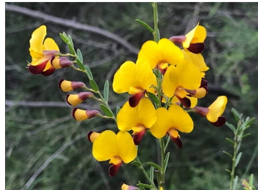
Bossiaea heterophylla - Picnic Point, GRNP

Bossiaea heterophylla (Variable Bossiaea) is one of our first peas to flower each year, starting in Autumn. It grows as an upright open shrub to one metre with flattened stems bearing large yellow and brown flowers.