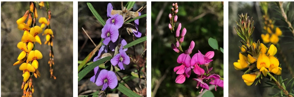
L-R above: Viminaria juncea (Native Broom), Hovea heterophylla , Indigofera australis (Native Indigo), Phyllota phyllicoides

With just a few local peas described in this article, you can at least appreciate some of the treasures that can be found in our local bushland. In an area that is also diversely-rich in Proteaceae and Myrtaceae , the many members of the sub-family Faboideae make up a significant part of the eco-system. While many of us can enjoy the colours on display as they brighten up the landscape, more importantly, they play an significant role in sustaining many of the local insect species - with the agreement that they will return the favour through pollination.