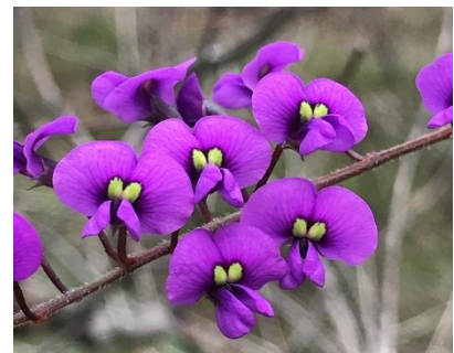
Hardenbergia violacea – Sandy Point GRNP

Hardenbergia violacea (along with another locally-occurring pea, Kennedia rubicunda ) is quite clever in that it has the ability to both climb or creep, depending on where the plant germinates. If there is nothing around to climb, then it has no choice but to creep until it finds an erect shrub. Even when it creeps over large areas, at flowering time it will hold the flowering stems vertically to increase its chances of attracting pollinators.