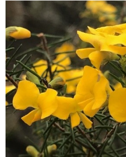
Dillwynia retorta – Picnic Point GRNP (left) Dillwynia retorta , yellow-flowering form, Illawong GRNP (right)

Dillwynia retorta (Eggs and Bacon) is by far our most common local pea flower species with populations widespread across all sections of the Georges River NP. From early Spring, the profusion of yellow and red pea flowers can be seen, although some plants will have only plain yellow flowers, but these are seldom seen. Most grow as shrubs up to two metres high, but low-growing forms may also occur