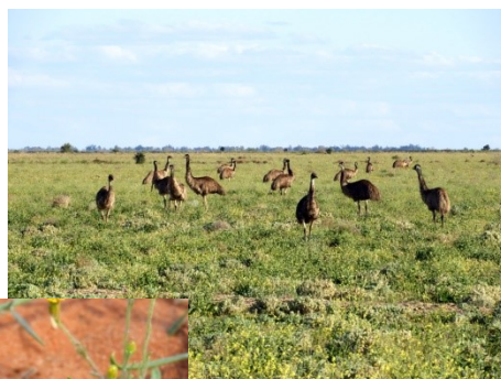
Right: Emus on a former cotton field.

At Toorale NP on the site of a former cotton farm, the land is slowly regenerating and the change in vegetation was very much appreciated by emus with literally hundreds feeding on the flats.