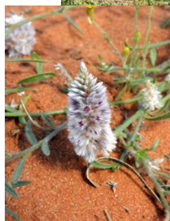
Far left: Polycalymma stuartii (Poached Eggs) Centre left: Swainsona sp. (Darling Pea) Left: Ptilotus leucocoma (Small Purple Foxtail)