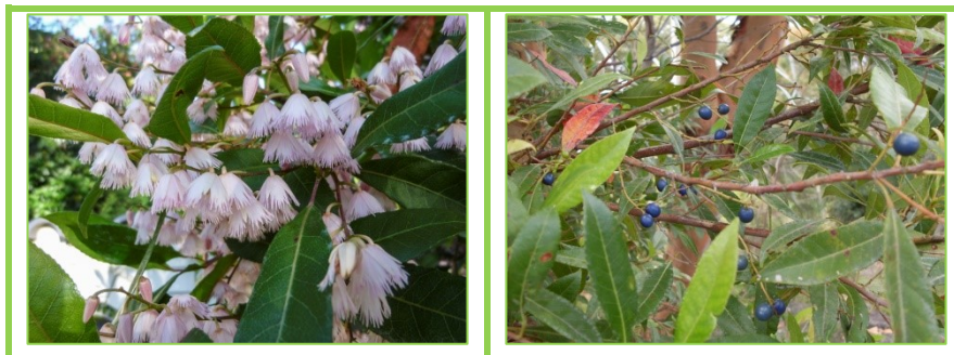
Above: Flowers of Blueberry Ash ; Leaves and fruit of Blueberry Ash