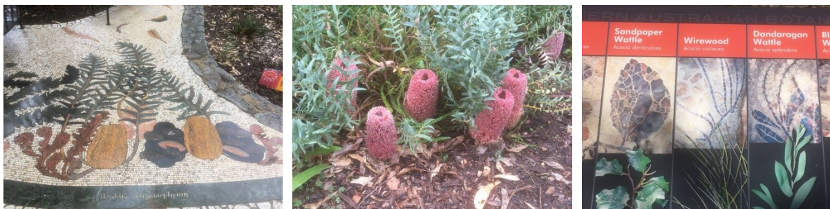
Above: Banksia mosaic, Banksia blechnifolia (Southern Blechnum Banksia), Acacia mosaic