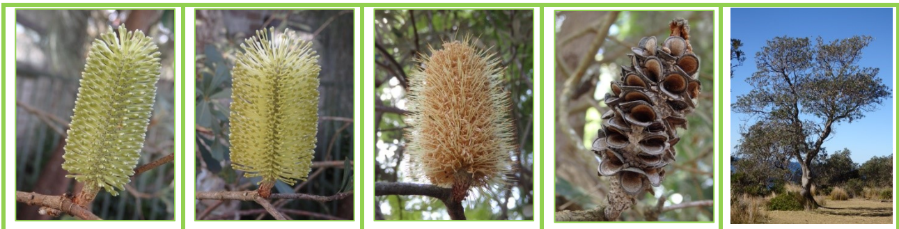
Photos above show three stages in the development of B integrifolia flowers, a cone after the release of seeds, and a mature tree near Snake Bay, South Coast NSW.

The oldest Banksia, B. integrifolia , flowers mainly during autumn and winter but can often have a few flowers on it at other times as well. It is popular with honeyeaters, particularly Red Wattlebirds and Noisy Miners. This species does not retain the seed once it ripens and so it is not generally attractive to seed-eating birds like parrots.