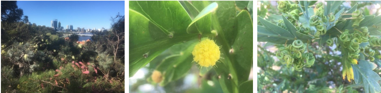
Above: View of Perth from Kings Park; Flowers and seed pods of Acacia glaucoptera (Flat Wattle)

Dave presented a selection of photos from Kings Park, Perth. The photos were taken in September 2019 when Dave and Jan travelled to Western Australia for the ANPSA conference and spent a week in Perth before joining a bus tour to Albany for the conference. The photos included colourful mixed plantings, imaginative mosaics featuring banksias and acacias, and a range of other Western Australian plants. A few of the photos are shown below.