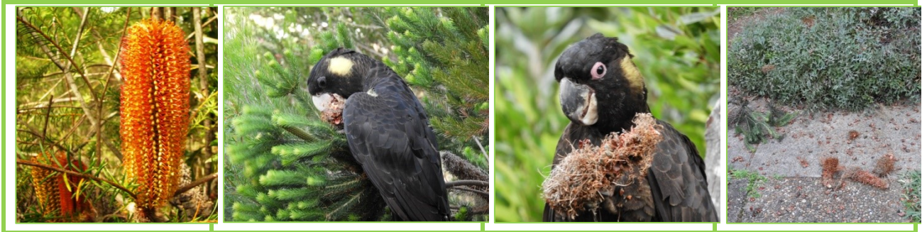
Photos above show flower spikes of Banksia ericifolia , Yellow-tailed Black Cockatoos with cones, and dropped cones, leaves and twigs, all in Graham and Liz's garden.

off the fruit cones and then systematically extract the tiny seeds and are often in the tree for over an hour. We know when they have visited, as the ground is strewn with debris from their activities!