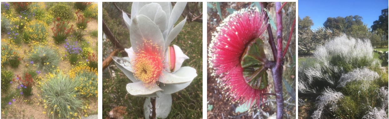
Above: Colourful mass plantings, Eucalyptus macrocarpa (Rose of the West), Eucalyptus youngiana (Large-fruited Mallee), Conospermum wycherleyi (Smokebush)