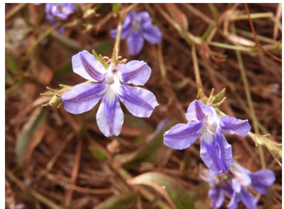
Goodenia stobbsiana [GF pic]

https://www.agric.wa.gov.au/rangelands/currant-bush-scaevola-spinescens-western-australian-rangelands