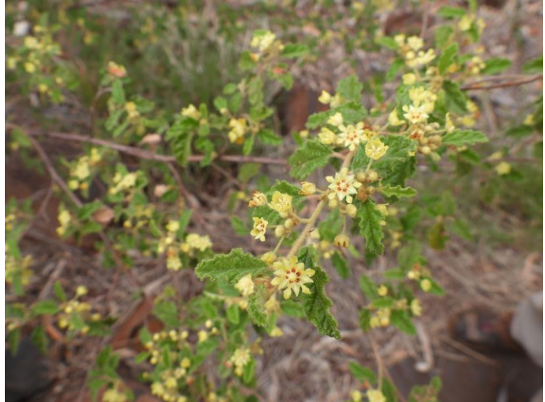
Yellow-flowered Rulingia ( Adrocalva luteiflora)

We should not overlook a nondescript plant that a member of our group noticed growing on a cliff face near Hancock Gorge in Karijini NP . It was the Ironplant, Astrotricha hamptonii , a member of the Araliaceae family (which includes the elderberry panax, Polyscias sambucifolius , common in Sydney). The Ironplant is restricted to the Hamersley Range and is a bio indicator of high-grade iron ore deposits; Lang Hancock's prospecting partner identified and mapped it from the air to identify the richest iron ore deposits in the area.