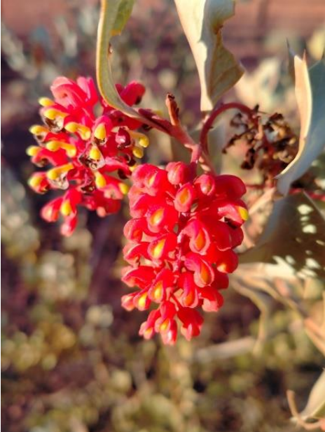
Holly-leaved Grevillea ( Grevillea wickhamii ) [GF pic]

Arid grevilleas and hakeas lent colour and scale to the vegetation. Examples were the ubiquitous Holly-leaved Grevillea ( Grevillea wickhamii ), and the Corkwood or Honey Hakea ( Hakea lorea ). The mallow family, Malvaceae has many representatives in the Pilbara. Apart from Hibiscus coatesii and Gossypium robinsonii , growing in the gorges were Rock Kurrajong ( Brachychiton acuminatus ), and Yellow-flowered Rulingia ( Adrocalva luteiflora ), an attractive shrub with round spiny fruits.