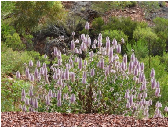
Pink Mulla Mullas ( P. exaltatus ) [GF pic]

The Pilbara supports at least 55 species of Acacia and we identified at least six (13 on the entire trip); they included the Grey-whorled Wattle ( Acacia adoxa ) and Hill's Tabletop Wattle ( Acacia hilliana ). In the Pilbara we found a wealth of flora quite different from the coastal vegetation further south.