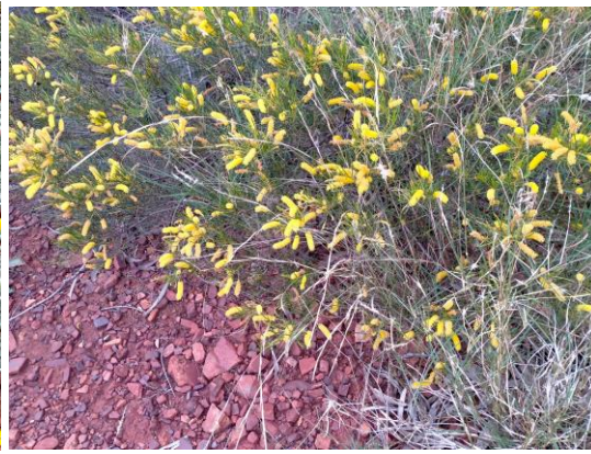
Hill's Tabletop Wattle ( Acacia hilliana ) [GF pic]

The Pilbara supports at least 55 species of Acacia and we identified at least six (13 on the entire trip); they included the Grey-whorled Wattle ( Acacia adoxa ) and Hill's Tabletop Wattle ( Acacia hilliana ). In the Pilbara we found a wealth of flora quite different from the coastal vegetation further south.