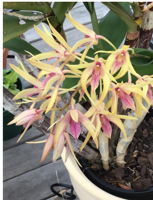
Dendrobium Elegant Heart is an orchid hybrid originated by W.T.Upton in 1986. It is a cross of Den. Peewee x Den. speciosum.