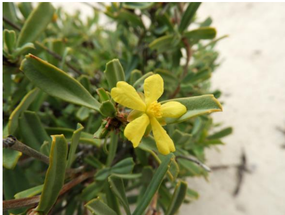
Tamala Rose ( Diplolaena grandiflora Rutaceae) [GF pic]; Stalked Guinea Flower ( Hibbertia racemosa ) [GF pic].

As we travelled north into more arid areas, eucalypts became scarce and acacias began to dominate the vegetation. In Western Australia the transition from eucalypt-dominated open woodland to Acacia-dominated shrublands has been mapped and recognised as the mulga-eucalypt line or boundary, corresponding to the isohyet of 250 mm annual rainfall.