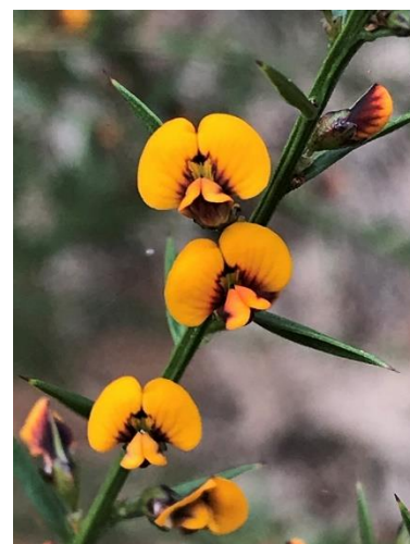
Daviesia ulicifolia (Gorse Bitter-pea) at Landsdowne