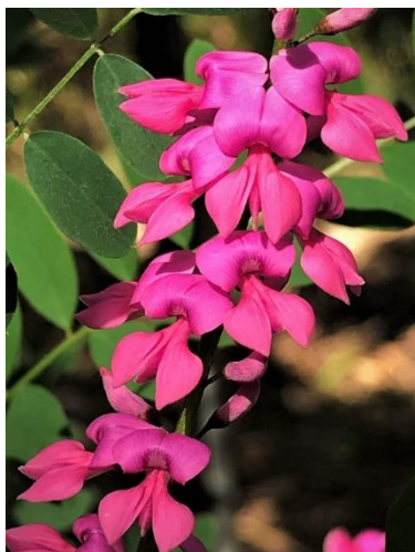
Indigofera australis (Native Indigo) The Crest Bushland Reserve

Our local reserves are also well represented by members of the pea family, Fabeaceae . With better rainfall over the past two years, most of these are decorating our local bushland with plenty of colour as they flower profusely. Some of the local pea flowering species have great potential if grown as garden subjects.