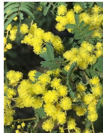
Acacia pubescens (Downy Wattle) Carysfield Park, Bass Hill

Flowering now is Acacia pubescens (Downy Wattle), a threatened species that is scattered across the Cumberland Plain, with healthy populations found mainly within the Canterbury-Bankstown and Liverpool LGA's. Unfortunately, many sections of its original habitat across western Sydney have been cleared as a result of urban development