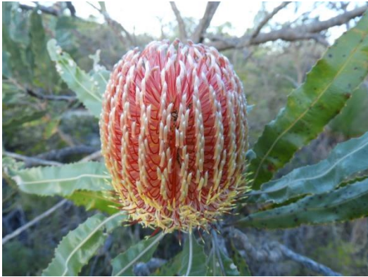
Firewood Banksias Banksia menziesii