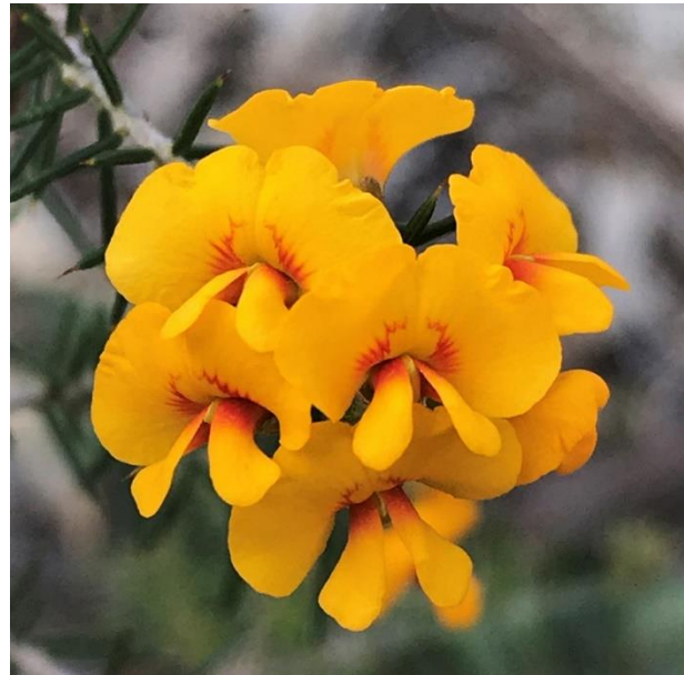
Dillwynia sieberi at Carysfield Park, Bass Hill

Dillwynia sieberi (Sieber's Parrot-pea, Prickly Parrot-pea) is probably the most common pea-flowering shrub in our local reserves. More broadly, it grows in woodland areas across the ranges and western slopes of NSW and more coastally between Newcastle and Nowra; also into the ACT, south-eastern Queensland and parts of south-eastern Victoria. It grows as a shrub to 1.5 metres and also bears needle-like foliage. It flowers from April to November with its peak flowering through Spring. The flowers are yellow-orange with reddish-brown markings that can vary within the species.