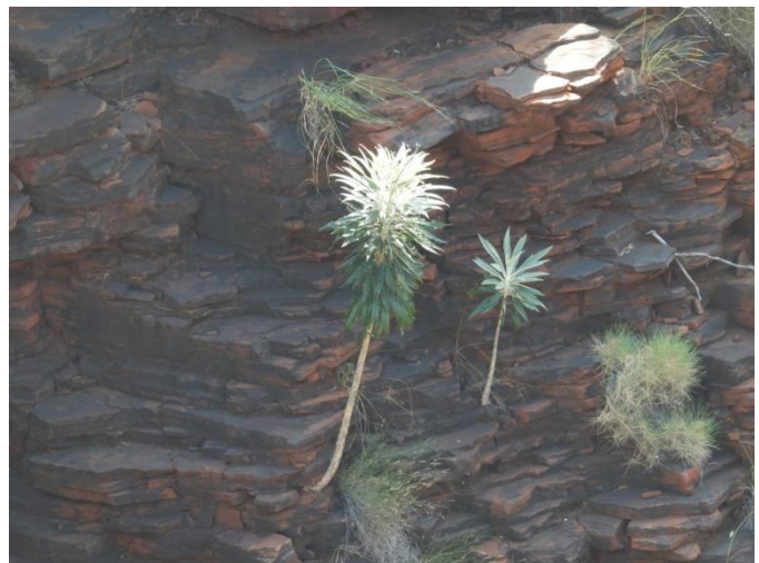
Ironplant, Astrotricha hamptonii

We should not overlook a nondescript plant that a member of our group noticed growing on a cliff face near Hancock Gorge in Karijini NP . It was the Ironplant, Astrotricha hamptonii , a member of the Araliaceae family (which includes the elderberry panax, Polyscias sambucifolius , common in Sydney). The Ironplant is restricted to the Hamersley Range and is a bio indicator of high-grade iron ore deposits; Lang Hancock's prospecting partner identified and mapped it from the air to identify the richest iron ore deposits in the area.