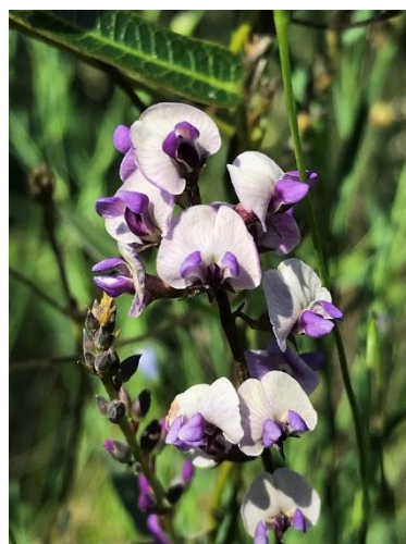
Glycine clandestina at Deepwater Park