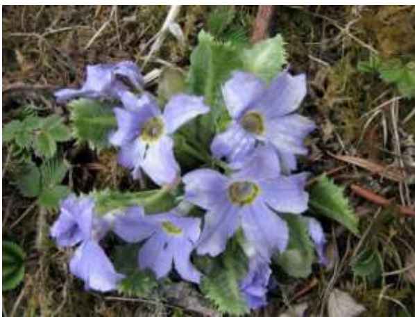
5 Primula bhutanica

At high altitudes, Graham and Liz saw dwarf bamboo on which the yaks graze, and slightly lower, hemlock and flowering rhododendron forests festooned with lichen and carpeted with blue primulas.