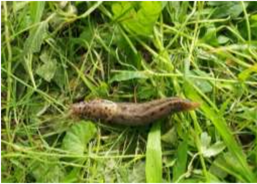
9 Leopard slug in Dorothy's garden

Limax maximus is the type species of the genus Limax . The adult slug measures 10–20 cm (4–8 in) in length and is generally a light greyish or grey-brown with darker spots and blotches, although the coloration and exact patterning of the body of this slug species is quite variable.