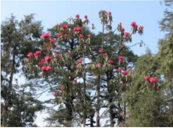
3 Rhododendron arboretum and hemlock forest

The wide altitudinal gradient is reflected in vegetation ranging from the treeless alpine zone through temperate conifer and broadleaf forests to subtropical forests. Forests cover 70% of the land and the small area of arable land in the valleys is intensively farmed for livestock and cropping.