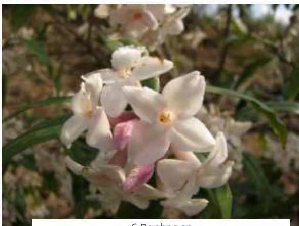
6 Daphne sp

Conifers dominated many forests. At lower altitudes Chir Pines ( Pinus roxburghii ) regenerate after fire but are susceptible to snow; at higher altitudes they are replaced by Blue Pines ( Pinus wallichiana ) which tolerate low temperatures but are killed by fire.