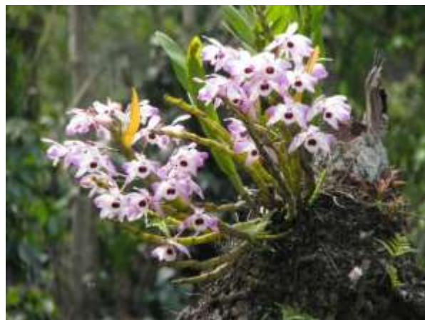
Figure 4 Dendrobium nobilis

Bhutan's national flower is also blue – the poppy Meconopsis galyidiana .