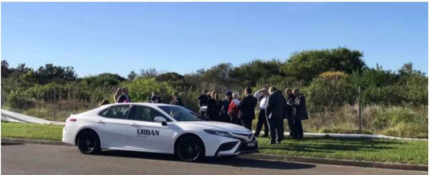
7 Conciliation Conference

“I was contacted by Randwick Council recently as someone who had made a submission about the development application. The developer has appealed Council's latest decision regarding the development to the Land and Environment Court of NSW. As a result, a section 34 conciliation conference was arranged for the morning of 9 June 2023, where representatives of the developer, the Council, anyone who made a submission and a Commissioner of the Court attended. A local resident, myself, a representative from Malabar Bushcare and a representative of the neighbouring golf course all spoke against the development. The council and developers then held a confidential meeting with the commissioner where the matter was adjourned. ”