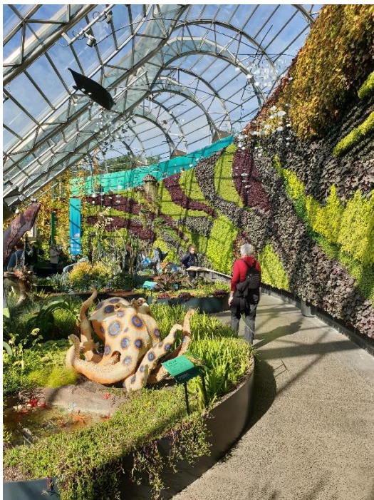
2 at The Calyx.

President Harbour Georges River Group APS NSW.