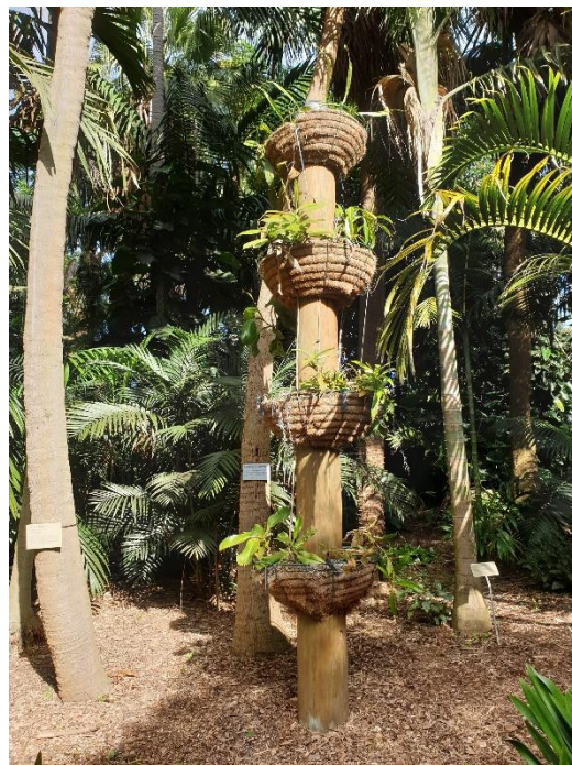
1 Rainforest in baskets.