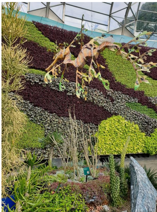
from The Calyx. photos by Dorothy, who likes leafy sea dragons