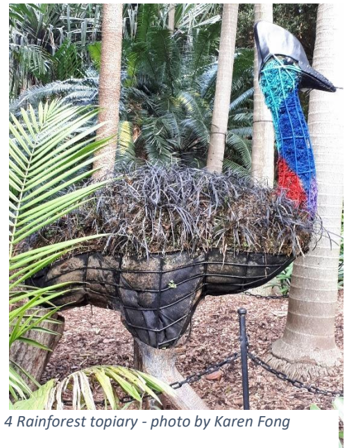
4 Rainforest topiary - photo by Karen Fong

A brief stop at the Cadi Garden led to a discussion on the Aboriginal uses of some plants such as banksias and food plants. We didn’t stop to look at the token veggie garden showcasing the original Farm Cove garden plants.