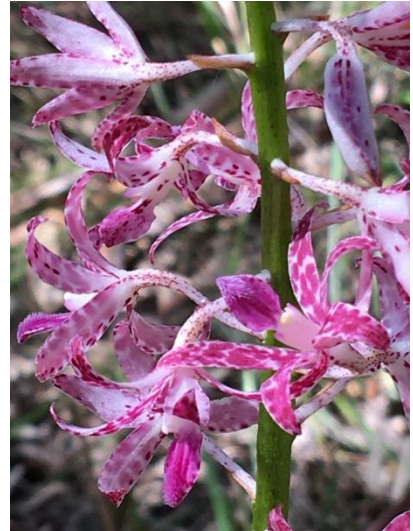
6 Dipodium variegatum Slender Hyacinth Orchid