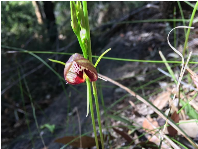
7 Cryptostylis erecta Bonnet Orchid