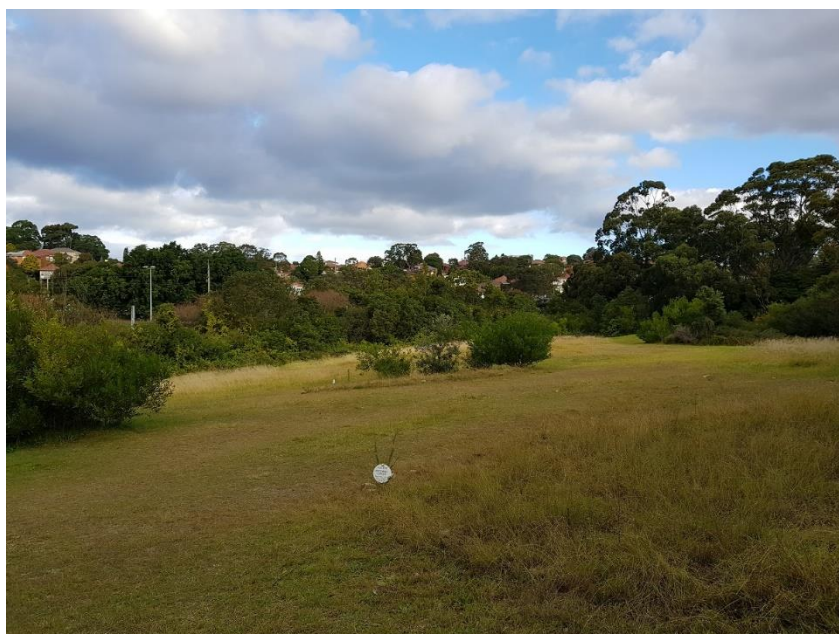
Bray Ave, Wollie Creek - part of our patch