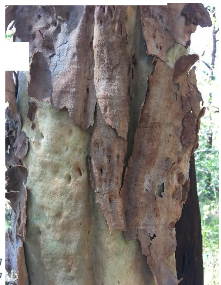
9 Time for a new skin - bark peeling from Angophora costata