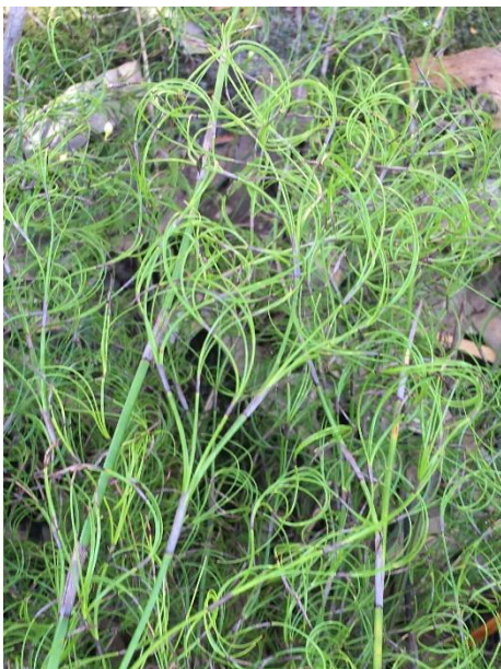
8 Caustis flexuosa Old Man's Whiskers