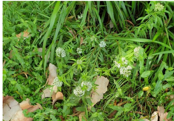
to the very modest

As well as flowers, I'm interested in plants and plant conservation generally, to which end I have been working on a citizen science project named "Flora Connections" . Flora Connections aims to connect community plant knowledge to government. Community scientists and botany groups have a wealth of on-ground plant knowledge. Government committees making decisions about threatened plants across Australia need on-ground plant data. Flora Connections hopes to connect community to government to improve outcomes for Australian plants, particularly for rare or threatened species which may be poorly known. We're currently developing a website and data collection guide which will launch in the next few months - stay tuned!