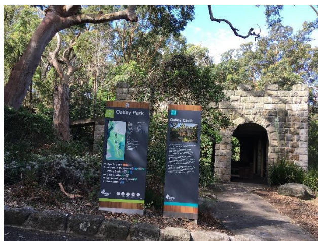
3 The Castle, Oatley Park