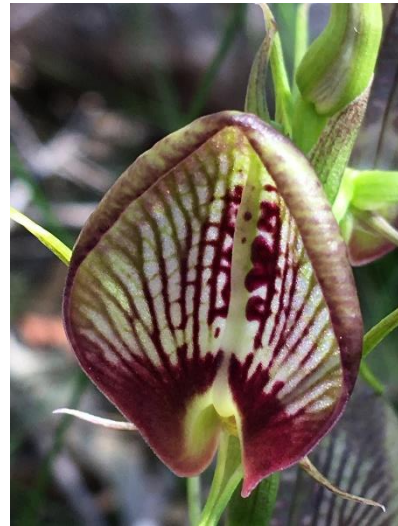
4 Flower of Cryptostylis erecta Bonnet Orchid