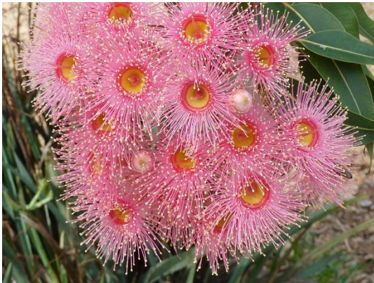
from the very showy

Flowering plants are the most diverse group of land plants, and surround us every day in the bush. Flowering plants emerged at least 130 million years ago and have since evolved a huge diversity of forms, especially in their flowers. Flowers vary hugely in size (<0.5mm to >1m!), colour, scent, shape, timing and more - features termed "floral traits" . For my PhD, I want to understand some of the ways in which floral traits vary, across both space and time. How does flowering time vary across Australia's ecosystems? How has flower size evolved in eucalypts? Has eucalypt flower size diverged between western and eastern Australia? Was the ancestral flower animal or wind pollinated? How many times has wind pollination evolved since the first flower?