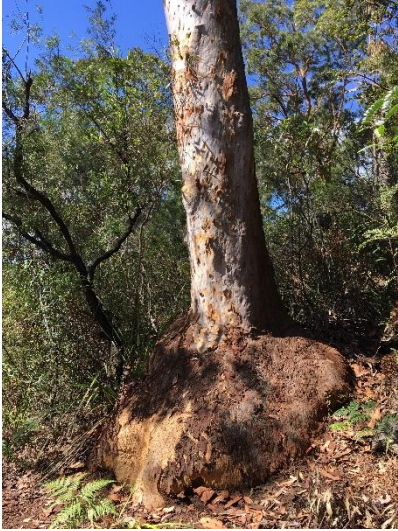
5 The amazing base of an Angophora costata Sydney Redgum