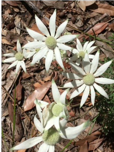
5 Actinotus helianthi Flannel Flower