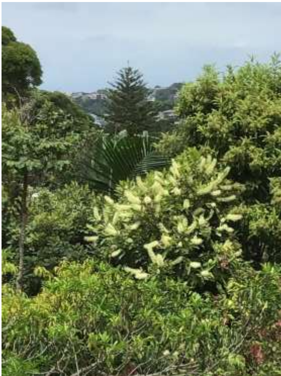
view over the O'Connors back garden rainforest: Ivory curl tree ( Buckinghamia celsissima ) in centre and Lemon Myrtle ( Backhousia citriodora ) on the right.