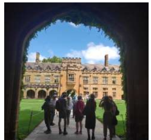
2 entering the Min Quad