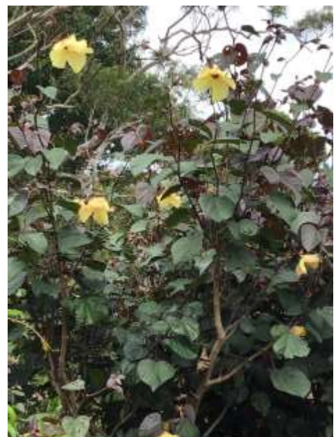
Hibiscus Tiliaceus Rubra , also from O'Connor back garden