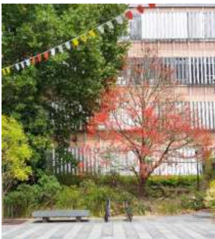
1 Illawarra Flame Tree Brachychiton acerifolius

White-trunked Lemon-scented Gums ( Corymbia citriodora ) provided welcome shade near the Cadigal Green and a Queensland bottle tree ( Brachychiton rupestris ) was spotted growing amongst Prickly-leaved and Broad-leaved Paperbarks ( Melaleuca styphelioides , M. quinquenervia ).