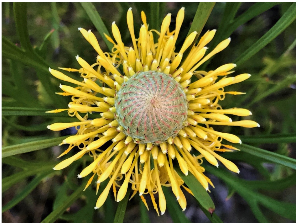
Photo taken by Karlo Taliana at Picnic Point, Georges River National Park

is the floral emblem of the East Hills Group