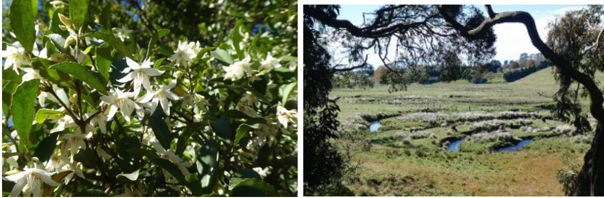
(L) Doryphora sassafras ; (R) Alan's Water

On a cold but sunny day in May, I ventured up Waterfall Way to Dorrigo, hoping to find the Food Angel Café open (sadly, it was not). Neither was the Dorrigo Rainforest Center, but it was possible to access the Skywalk. The view over the rainforests to the coastline was lovely in the clear air. Doryphora sassafras , (Sassafras), heavy with flowers at this time of year grows on both sides of the wooden walkway. This large rainforest species of Gondwanic origin (ref: Alex Floyd) reaches 30m and its toothed, elliptical leaves have a sweet perfume when crushed.