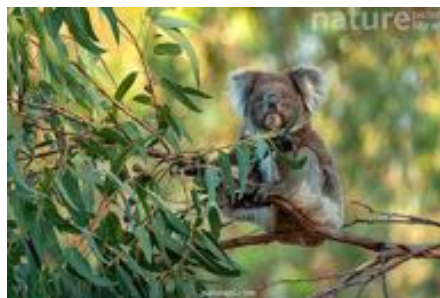
Koala and E. viminalis (manna gum)