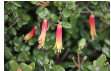
(L) Callistemon rugulosus (scarlet bottlebrush); (M) Templetonia retusa (cockies tongues); (R) Correa backhouseana var. orbicularis (round-leaf correa) an endemic species

Between December 2019 and January 2020, over 50% of Kangaroo Island was subjected to ferocious bushfires. The KI fire damage was most marked on the western end, including Flinders Chase National Park. Even the sparse vegetation on the rocky ocean cliffs was burnt. One year on, ash still lines the high tide mark on beaches. The majority of plantation timber is located in this region and the fires destroyed 95% of mature hardwood ( Eucalyptus nitens , shining gum and E. globulus , Tasmanian blue gum) and softwood ( Pinus radiata , Monterey pine) reserves.