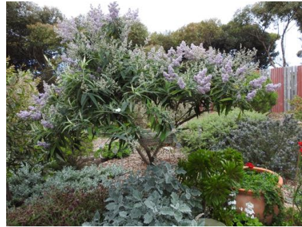
(L) Aloe sp ;(R) Buddleja with cottage plants

I also went to Stokes Bay Bush Garden as I had read about the devastation through this unique collection of native plants that John and Carol Stanton had established over many decades. Nothing could have prepared me for the total annihilation of this property – a blackened ground of burnt shrubs with emerging patches of wildflowers. The Stantons also lost their home but with typical KI spirit are staying to rebuild and restore their garden.