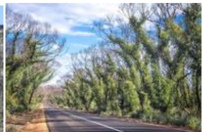
Natural vegetation Playford Highway, SW KI: (L) Before (M) After (R) Regrowth

In late spring 2020, I spent five weeks on the Island keen to see how the community and landscape were recovering. An Inaugural Open Gardens for Spring event was held in 2020 and I visited two properties on the north coast that had suffered extensive damage 12 months ago. The KI community spirit and support extended to those impacted by the bushfires was clearly evident with each of the gardens receiving over 200 visitors on the open day. Members of the KI Garden Club provided home-baked cakes, slices and scones with tea and coffee, and visitors' donations raised funds for local causes. The work that had gone into restoring the gardens was amazing: attractive mixed beds of water-wise species, such as salvias, succulents, native grasses, herbs and small shrubs; the clever use of dry stone and gabion walls and open spaces of lawn. Wicking beds are used for produce gardens and orchards are netted against cockatoos.