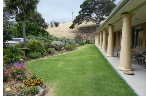
Farm gardens 12 months post bushfires at: (L) Middle River, (R) Western River Cove