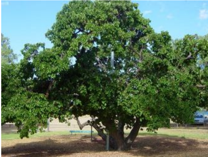
The Mulberry Tree at Reeves Point, KI

In closing, I wish to mention a significant tree, planted in 1836 at Reeves Point, Kingscote. The Morus nigra (mulberry tree) is the only surviving tree of an orchard established by first settlers. The mulberry bears fruit annually and is thought to be the oldest fruit tree in South Australia. It is a “living testament to the tenacious spirit of early pioneers” (KI Pioneers Assoc.). Finally, three stanzas from a poem published in 1911: