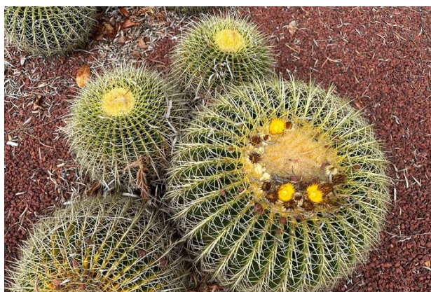
3 barrel cactus at Woolloomoo gate