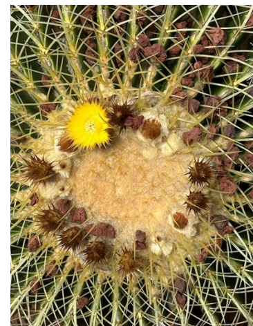
4 close up of barrel cactus