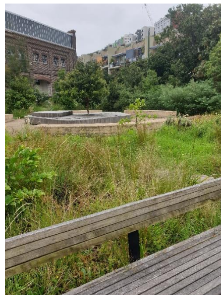
9 Gardens at Eveleigh Precinct – we may visit one day, when visiting the Rooftop garden