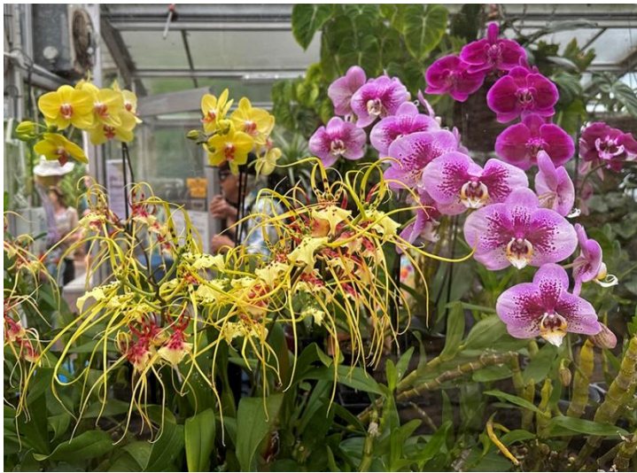
6 orchids in hot house