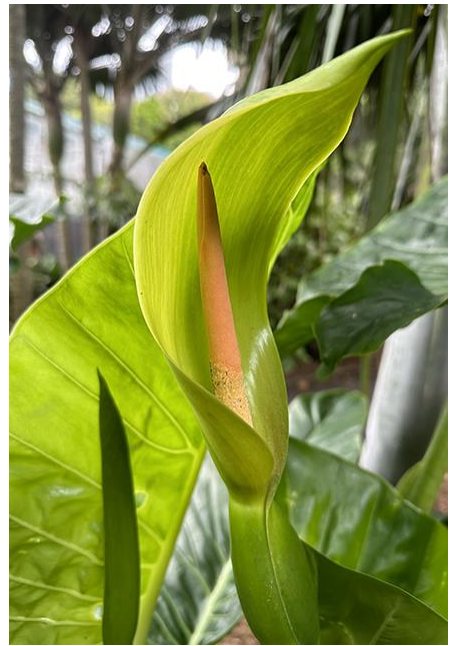
5 Australian native green lily