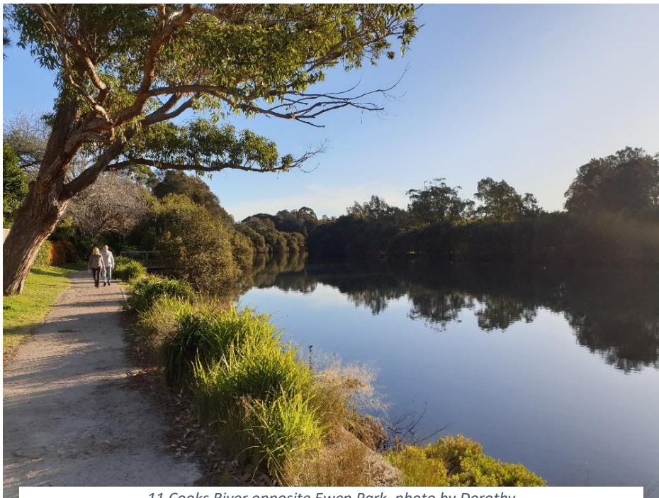
11 Cooks River opposite Ewen Park

https://www.facebook.com/groups/1328674687627886