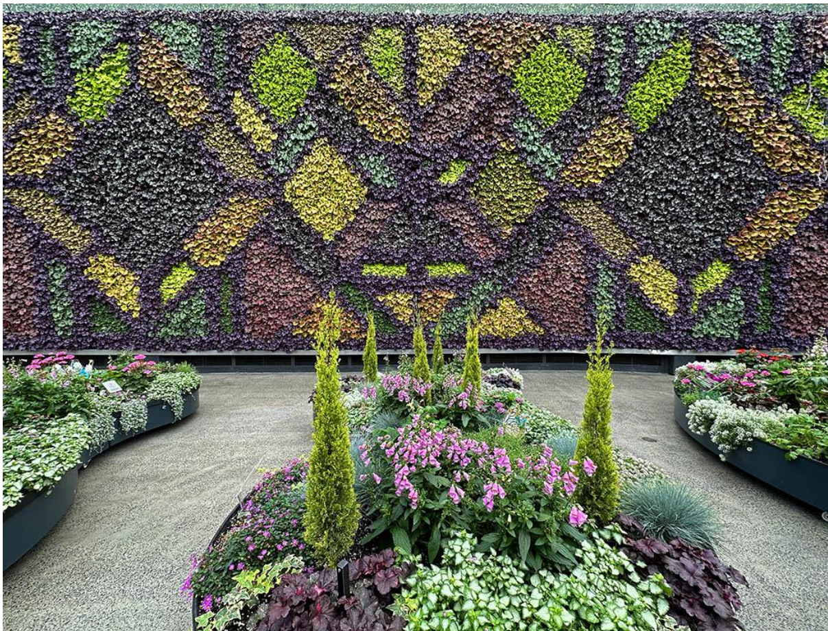
7 Floral display in Calyx.

Note the 'Green Wall' is actually living plants.