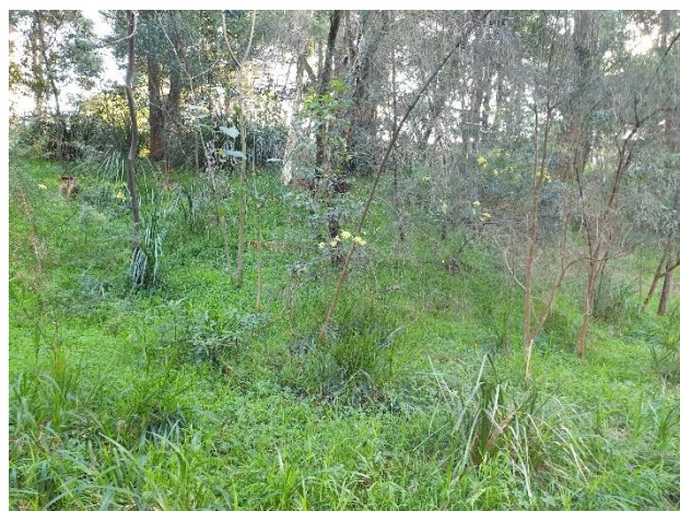
1 The Greenway, Cadigal Reserve