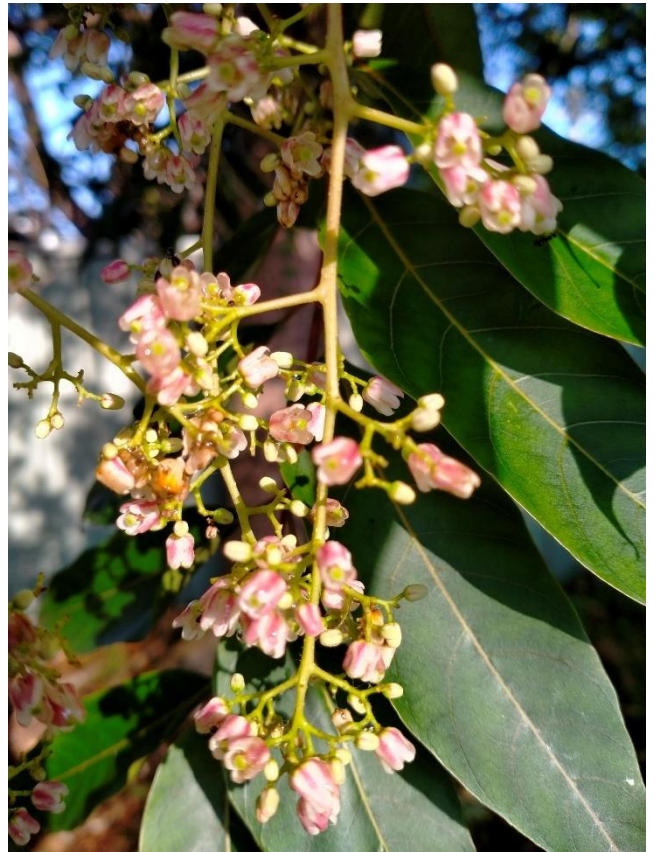
2 Toona ciliata (Red Cedar)